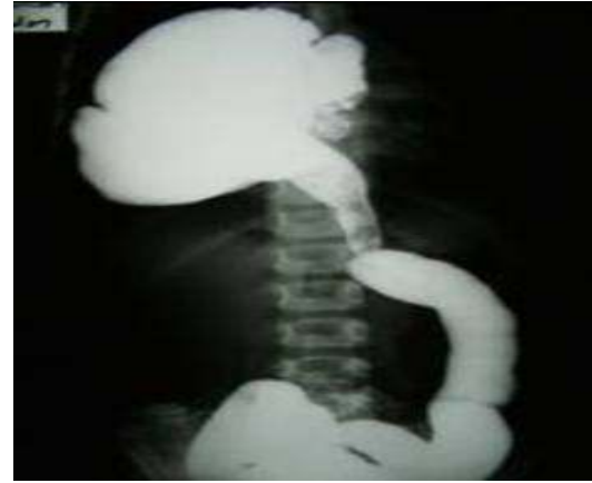
Fig. 3: Barium enema examination confirmed the diagnosis hernia of Morgagni

severe, necessitating admission to the intensive care unit. The patient with Marfan syndrome (Case 6) had RCI for one year. After most recent pediatric visit, she had been evaluated due to a chest infection. No prior history of abdominal trauma was observed, and a previous chest X-ray and colonography were noted as unremarkable without evidence of abdominal herniation or lung pathology. However, the lateral radiography showed unexplained air fluid levels. A thoracic CT scan was performed on Case 6 after observing multiple bowel loops in the right hemithorax. After 3 weeks, her respiratory complaints (cough and wheezing episodes) continued, and a chest X-ray was repeated, showing anterior herniation of bowel loops. Her sister (Case 7) had chronic constipation. The chest X-ray and lateral radiography findings (a gas-filled cystic mass in the right-middle and inferior region of the lung) led us to suspect MH. Her thoracic CT scan showed bowel loops herniating to the right side of the chest. The diagnosis was confirmed by colonography. Surprisingly at surgery, the patient was found to have bilateral MH.