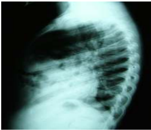
Fig. 1. (a) Antero posterior and (b) lateral chest radiograph demonstrating retrosternal gas shadow. These findings were interpreted as anterior herniation of bowel loops.