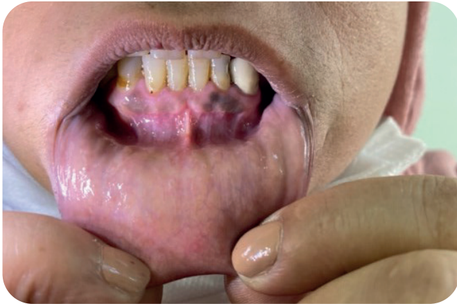
Fig. 3. Hyperpigmented macules on lower gingival mucosa and yellow discoloration of inner lips