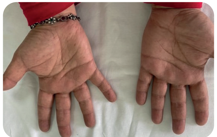
Fig. 2. Discrete macular hyperpigmentation of palms

intermammary skin, labia majora and minora, and discrete hyperpigmented macules in the vestibulum. Bilateral palmar hyperpigmented macules were also detected. (Fig. 2) Moreover, both discrete and slightly coalescing hyperpigmented macules on the inner lips, gingiva (Fig. 3) and hard plate were observed. Regular longitudinal melanonychia of the index and middle finger was seen. Dermatoscopic examination of lentiginos on the inner lips disclosed light brown dots and globules in varying sizes, a curvilinear pattern and a reticular pigment network. (Fig. 4) The mucosal lesion revealed a yellowish background. Neither of a ring-like, fish scale-like nor hyphal pattern, which were described mainly in benign mucosal lentiginous lesions, was observed. Subsequently, the patient has undergone a colonoscopy to exclude any malignancy accompanied by mucocutaneous hyperpigmentation disorders, which revealed no abnormal findings. Endoscopy of the upper gastrointestinal tract revealed antral gastritis and bulbitis without any suspicious findings of malignancy. Laboratory tests including complete blood count with renal and liver biochemistry were normal except for a decreased serum hemoglobin and hematocrit level. A peripheric blood smear was performed and revealed hypersegmented neutrophils as wells as hypochromic erythrocytes with anisocytosis. Accordingly, our patient was given iron and B12 replacement therapy.