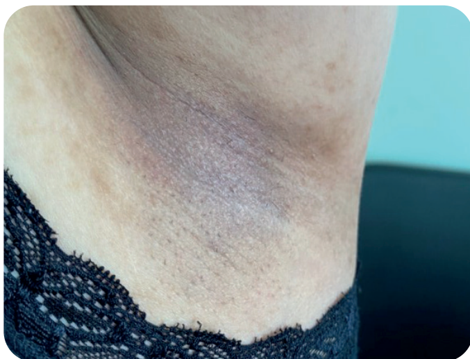
Fig. 1. Diffuse hyperpigmentation of axilla, light-brown discrete macules

Physical examination revealed a Fitzpatrick 4 skin with diffuse hyperpigmented macules in axillae (Fig. 1),