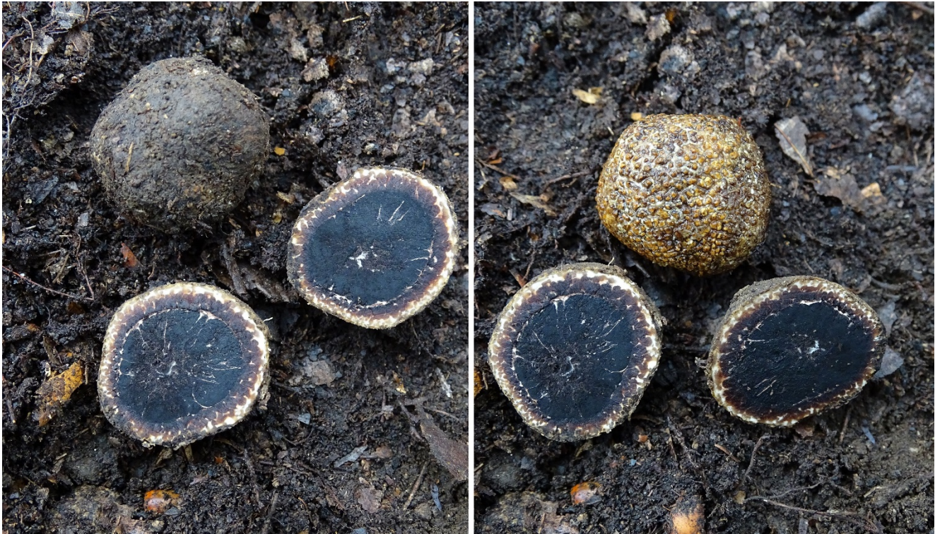
Figure 1. Ascocarps of Elaphomyces decipiens

Elaphomyces decipiens was reported to grow in neutral to sandy soil in deciduous forest, especially under oak trees (Montecchi and Sarazini, 2000).