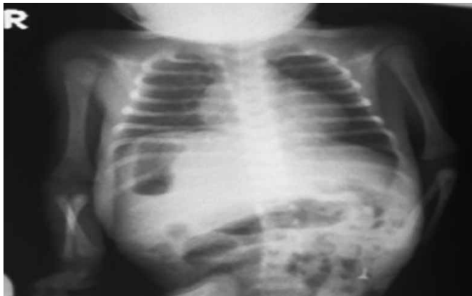
Figure 1. X-ray of the chest demonstrating elevation of the right hemi-diaphragm caused by the presence of the dilated colonic loop and gas accumulation

Trisomy X occurs from a nondisjunction event, in which the X chromosomes fail to properly separate during cell division (6). The first published report of a woman with a trisomy X was written by Jacobs et al. (7) in 1959. Approximately 1 of every 1,000 newborn girls carries a 47,XXX karyotype (8). Most individuals with 47,XXX are diagnosed incidentally prenatal genetic screening (9). The karyotype is usually not associated with a characteristic physical phenotype. However, minor physical findings can be present in some individuals