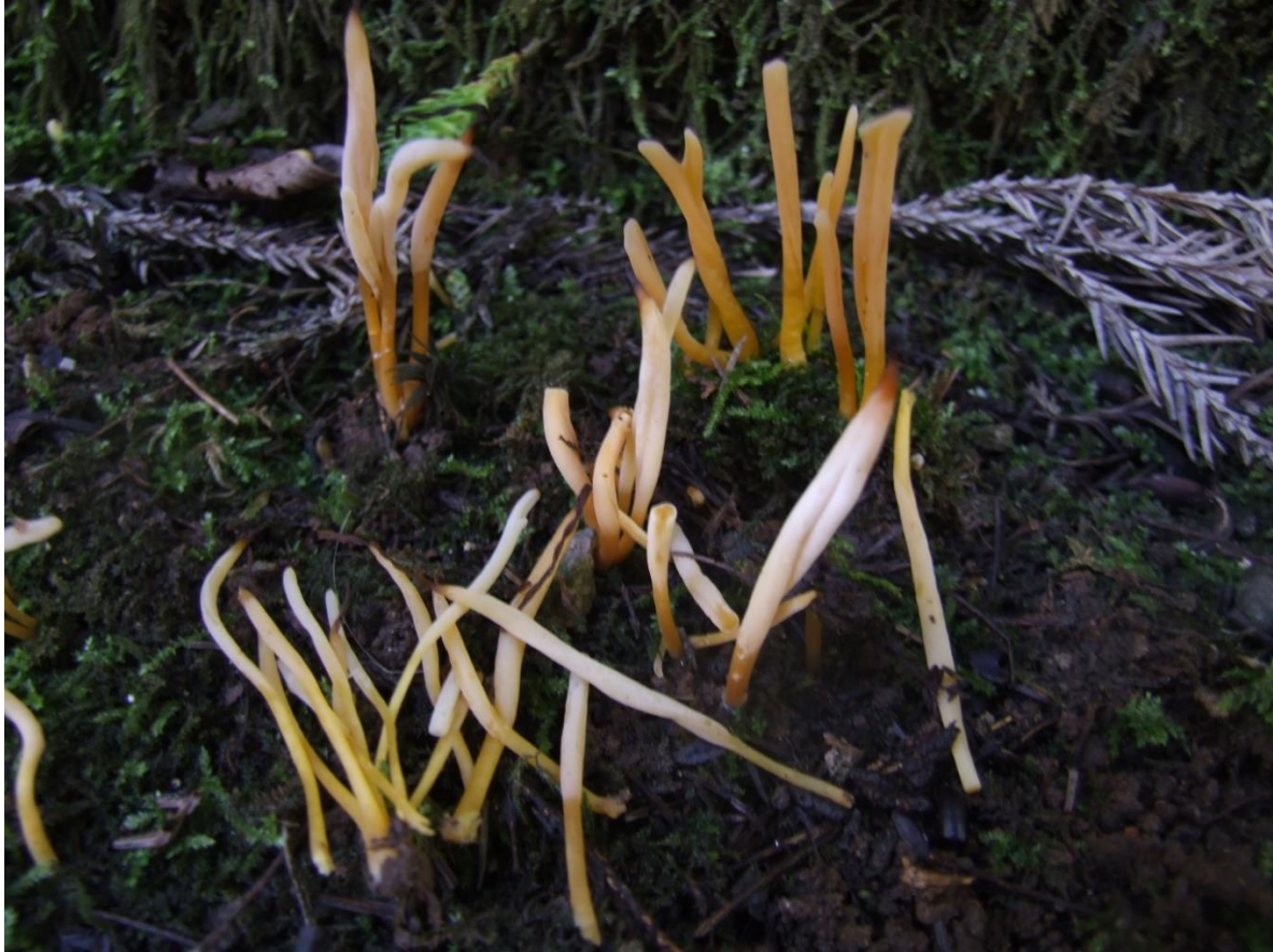
Figure 1. Basidiocarps of Clavulinopsis fusiformis

Clavulinopsis fusiformis was reported to grow gregariously or in dense clusters with fused bases, on soil among grass or mosses, in poor meadows, grassland or in woods under hardwoods, conifers or shrubs (Breitenbach and Kränzlin, 1986; Buczacki, 1989; Ellis and Ellis, 1990; Jordan, 1995; Bessette et al., 2007; Acharya et al., 2017; Knudsen and Vesterholt, 2018).