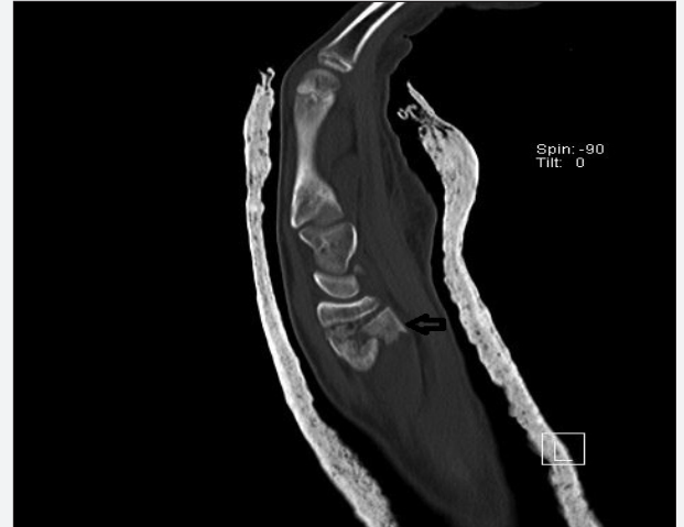
Fig. 2b. The appearance of the free volar metaphyseal fragment

brace was used until the stitches were removed on the 15 th day then after removal of the brace, active wrist movements were begun. At the final follow-up at postoperative 14 months, the patient had pain-free and full range of motion of the wrist. There was no growth disturbance or deformity. Radial inclination, palmar tilt angle and ulnar variance were within normal limits (Fig. 3a-b).