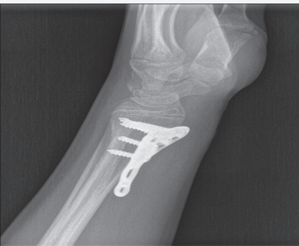
Fig. 3b. At the 14 th month after the operation

tunnel was 6 mmHg and 14 mmHg respectively. The patient did not have any marked swelling or edema but the symptoms were severe and there was a high tendency to displacement, it was decided to surgical treatment. Plate osteosynthesis was performed via volar approach. After exposure of the fracture, the metaphyseal fragment was free, the capsule and pronator teres had been torn. There was no other evident finding except for hematoma in the volar region. The symptoms receded immediately after the surgical treatment and the hypoesthesia was resolved on postoperative second day. Two-point discrimination was measured 15 mm at the 7 th day. At the follow-up in the 3 rd week, two-point discrimination was measured below 5mm and abductor pollicis strength was measured 5/5. Final follow-up at 16 months, the patient was symptom-free and there was no deformity (Fig. 6a-b).