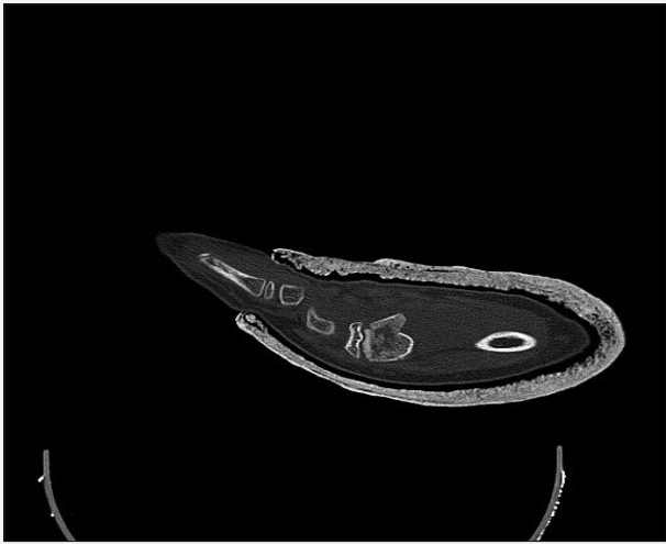
Fig. 5a. After the closed reduction

The main differences were that radiologically the fragment in the metaphysis was not a classic triangle shape and was separate from the physal line besides the free cubic-shaped, cortical continuity was lost. This difference can be reflected in the stability. Moreover, it was interesting to see median nerve neuropathy in both cases. It is well known that median and ulnar nerve neuropathy may be seen following distal radial fractures (Widmann et al., 1995). But this condition is encountered more in adults and is quite rare in children. The median nerve neuropathy may occur because of neuropraxia or axonothmesis developing from tenting of the nerve or tractional injury caused by the displacement of the fracture fragments. In these types of injuries, if there is no axonal damage, the symptoms regress rapidly after reduction. Neuropathy in the median nerve with increasing compartment pressure or marked hematoma in the volar region may result in acute carpal tunnel syndrome (Widmann et al., 1995; Niver and Ilyas, 2012). Plaster casting with the wrist in flexion or in excessive mould for prevention to displacement prepares a base for the median nerve lesion.