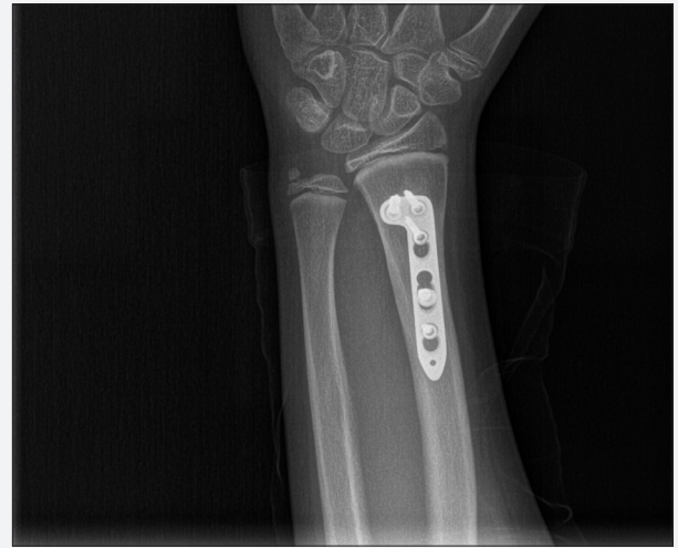
Fig. 6a. Final radiograph of the Case 2

In a study by Waters et al. (1994), the treatment and follow-up of 8 children with median nerve neuropathy and Type II epiphyseal injury, he recommended an algorithm for these