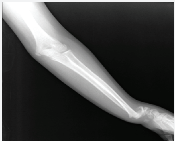
Fig. 4b. Case 2 which was evaluated type I epiphyseal injury

The treatment principles for distal radius epiphyseal injuries are generally the same as for metaphyseal fractures. The possibility of displacement in epiphyseal fractures after reduction is less than in metaphyseal fractures. In other words, the internal stability of the epiphyseal fractures is better than that of metaphyseal fractures (Waters et al., 2000). Particularly in SH Type II fractures, surgical treatment is almost never required because of the stability maintained by the metaphyseal fragment. Although the injuries in both of the cases presented here evaluated initially to be Type II but they were completely different from Type II injuries.