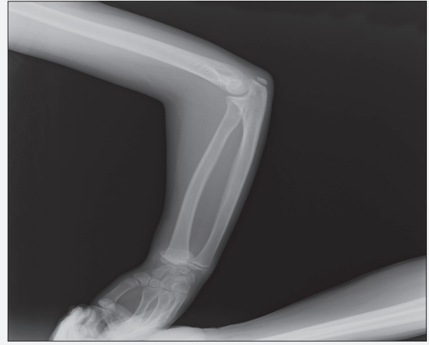
Fig. 4a. Case 2 which was evaluated type I epiphyseal injury

Distal radius are the most commonly injured bone in childhood (Mizuta et al., 1987; Cheng and Shen, 1993; Khosla et al., 2003). While the metaphyseal fractures are more often in young children, epiphyseal injuries increases with age. Particularly in the prepubertal period, accelerated growth which results in relative osteoporosis has been held responsible for the increase in epiphyseal injuries (Jones et al., 2002). The majority of epiphyseal injuries are stable,