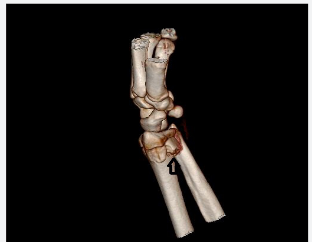
Fig. 2c. The appearance of the free volar metaphyseal fragment

Sixteen-year old male patient presented at the Emergency Department after a fall on his outstretched hand while playing football. After the radiological examination we have initially evaluated a SH Type II epiphyseal injury in the distal radius (Fig. 4a-b). Prior to reduction, there was severe pain, tingling and hypoesthesia in the median nerve distribution. There was also impaired ligh touch sensation. In addition to these findings two point discrimination was absent and abductor pollicis motor strength was measured 3/5. Immediate closed reduction and short arm cast was applied. As in Case I, X-rays was taken after casting revealed that the metaphyseal fragment was free and the fracture pattern differed from that of a classic Type II epiphyseal injury (Fig. 5a-b). As the complaints had not subsided after 48 hours observation, the cast was opened and compartment pressures were measured. The compartment pressures in the volar forearm and carpal