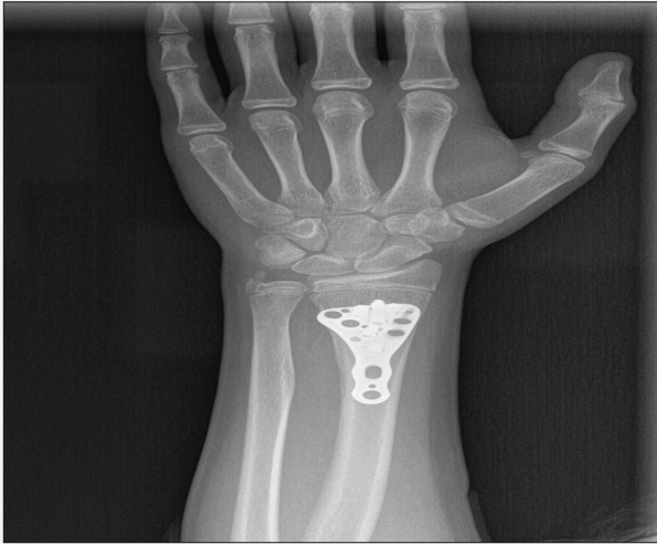
Fig. 3a. At the 14 th month after the operation

tunnel was 6 mmHg and 14 mmHg respectively. The patient did not have any marked swelling or edema but the symptoms were severe and there was a high tendency to displacement, it was decided to surgical treatment. Plate osteosynthesis was performed via volar approach. After exposure of the fracture, the metaphyseal fragment was free, the capsule and pronator teres had been torn. There was no other evident finding except for hematoma in the volar region. The symptoms receded immediately after the surgical treatment and the hypoesthesia was resolved on postoperative second day. Two-point discrimination was measured 15 mm at the 7 th day. At the follow-up in the 3 rd week, two-point discrimination was measured below 5mm and abductor pollicis strength was measured 5/5. Final follow-up at 16 months, the patient was symptom-free and there was no deformity (Fig. 6a-b).