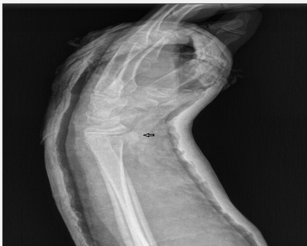
Fig. 2a. Case 1 after closed reduction and casting

was a displaced fracture in the distal radius conforming with SH type II epiphyseal injury (Fig. 1). Closed reduction and short arm cast was applied. Although acceptable reduction was obtained, there was a free metaphyseal fragment in the volar side of the distal radius (Fig. 2a-c). During casting, there was not stability which is seen in Type II epiphyseal injuries and tendency to displacement was also determined. The symptoms of median nerve neuropathy did not change after the procedure. The extremity was elevated and the patient was monitored closely. The symptoms had not receded at the end of 24 hours observation, the cast was opened in the form of a plaster splint. There was no marked degree of swelling or tightness in the forearm and volar surface of the wrist. Compartment pressures were measured (Stryker STIC, Mississauga, Ontario, Canada) 7 mmHg in the forearm and 11 mm Hg in the carpal tunnel. Due to the ongoing symptoms of median nerve neuropathy, open reduction was performed via volar incision and plate osteosynthesis was performed (TST, Rakor tibbi aletler, Istanbul) During surgery, it was seen that the capsule and pronator quadratus had been torn thus the fragment had caused the contusion on the nerve. After open reduction of the fragment, osteosynthesis was performed with a locking plate. Carpal tunnel release was not performed because of the normal compartment pressures. The symptoms of the median nerve subsided on postoperative day one. A