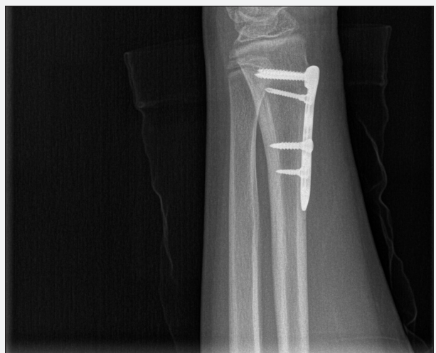
Fig. 6b. Final radiograph of the Case 2

types of injuries. According to this algorithm, in patients with symptoms of neuropathy persisted after closed reduction, if compartment pressure is measured over 30 mmHg, pin fixation and compartment release was recommended. In the cases presented here, as symptoms persisted after closed reduction and casting, the casts were removed and compartment pressures was measured three times in both the forearm and the carpal tunnel. Although compartment pressures were raised, it was not seen to be at a level that required fasciotomy or carpal tunnel release. The epiphyseal injury pattern was different from Type II injuries and there was potential instability it was thought that there had not been recovery because of the metaphyseal fragment pressure on the median nerve. We had not performed carpal tunnel release during the osteosynthesis procedure, the complaints started to decrease after surgery view that the metaphyseal fragment had caused compression on the median nerve. In both cases, we have preferred the plate osteosynthesis with a volar approach. Surgical treatment is rarely required for epiphyseal injuries in children (Houshian et al., 2004; Jordan and Westacott, 2012). As a general rule, the use of K-wires is recommended for surgical treatment in children (Miller et al., 2005; Jordan and Westacott, 2012). As the use of K-wires on the volar side is not reliable and because of the patients