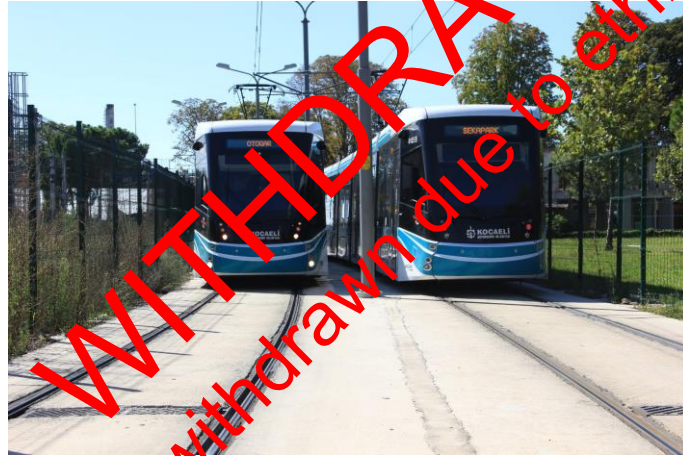
Figure 1. Akcaray light rail system

Akcaray, as an alternative solution to public transportation, started its first journey in June 2017. It carries a total of 12 low-floor two-way trams (Figure 1) and 5.1 km of Sekapark-Otogar locations, and the route of the tramline is shown in Figure 2 [17].