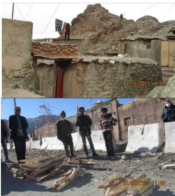
Figure 2. Traditional houses and selling wood by rural people (Pictures by author, January 2021).

Rural population in Iran live in an unstable environment and geographically, villages are extremely diverse and more than 65% of them have population less than 250 persons, which do not provide sufficient population threshold for most of services and sustainable economic and job creation activities. Only 7.5% of rural areas have population more than 1000 persons (Kalantari et al., 2008) (Figure 2).