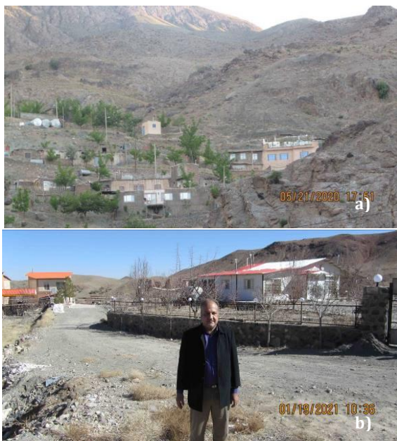
Figure 3. a) In Razg village (12 km distance to Birjand, center of South Khorasan province, east of Iran). b) In Hariwand, Fanood, Kahi and Khorashad villages (25 - 70 km distance to Birjand, center of South Khorasan province, east of Iran).

Urban growth processes in Iranian environments are mainly initiated from rural centers, which are largely surrounded by farmlands and fertile soils. Such proximity between these two utilities can cause conflict between multiple stockholders of different interests, which is normally associated with removal of agricultural fields and productive lands to provide space for more urban construction. In this regard, during the last four decades, the country has experienced 40% of growth in its population size and urbanism rate, which are also projected to continue during the upcoming decades. Urban expansion on agricultural land-use intensity is associated with a reduction in agricultural land-use intensity and GDP in industrial sector negatively affects farmland intensity. By establishing appropriate socio-economic and cultural-recreational attractions in areas with lower levels of competition, the pressure of future population growth can be shifted to areas with higher suitability for urbanization and lower competitions with farmlands (Iranian Bureau of Statistics, 2021; Moein et al., 2018; Golmohammadi, 2012; Golmohammadi, 2020) (Figure 3).