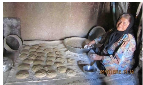
Figure 6. Baking bread in a disadvantaged rural region (Zirg village, 50 km distance to Birjand, center of South Khorasan province, east of Iran) (October 7, 2012).