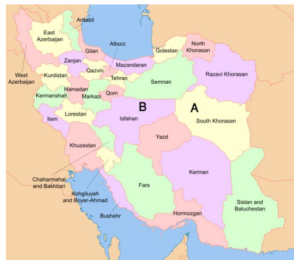
Figure 1. Map locations of doing this study, A (South Khorasan Province, east of Iran) and B (Isfahan province, center of the country) (Iranian Bureau of Statistics, 2021).

Main locations of doing this study were two provinces of Iran, namely South Khorasan province, east of Iran (especially, first rank of doing this study) and Isfahan province, in the center of the country (second rank of doing this study), because of accessibility of them for researcher. Statistical society of the research includes rural people in some selected rural regions in these provinces. For doing this study utilized qualitative approach with its main tools for gathering information such as participatory observation, maps, scientific articles, pictures, documents (Iranian and foreign scientific magazines and journals, TV and radio programs, Iranian Bureau of Statistics), discussion with experts, professors and beneficiaries and field research specially in above two provinces. In below map, shows locations of doing this study as A and B (Figure 1).