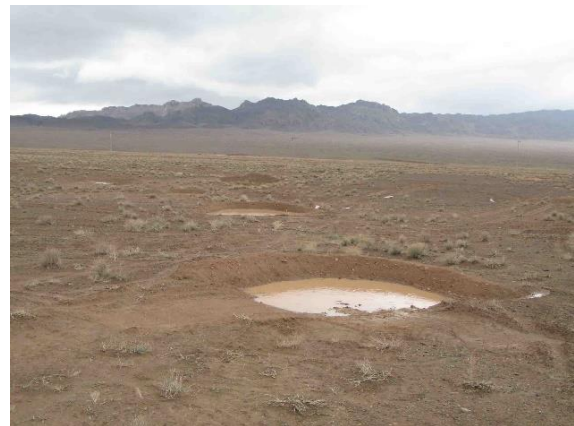
Figure 9. Some watershed management projects for saving valuable water of floods for confronting to long periods of drought in South Khorasan province, east of Iran (By author, 2010).