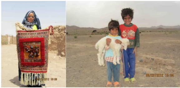
Figure 7. Nomadic lifestyle people and their traditional woman carpet weaver and children with poor health and education conditions in a disadvantaged and dried region near Qaen, 110 km distance to Birjand, center of South Khorasan province, east of Iran (May 27, 2012).