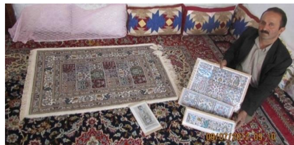
Figure 5. Carpet weaving in rural house as a main instrument for helping household economy in a disadvantaged rural region (Zirg village, 50 km distance to Birjand, center of South Khorasan province, east of Iran) (October 7, 2012).