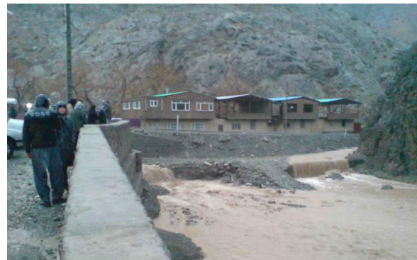
Figure 8. Floods and their damages that caused loss of valuable water after a long period of drought in South Khorasan province, east of Iran (By author, February, 2012).

The limited access to the job opportunities in drought-affected rural areas led to an increase in unemployment, and in some cases, to people seeking work elsewhere. This experience encourages the young people of vulnerable families to want to never return to the farm. This loss of the next generation of potential farmers may lead to an undeveloped form of agriculture that is more vulnerable to future droughts and other natural disasters. Therefore, support should be provided to increase the resilience of young people and to allow them the choice to continue farming in the rural areas (Keshavarz et al., 2013) (Figure 8 and Figure 9).