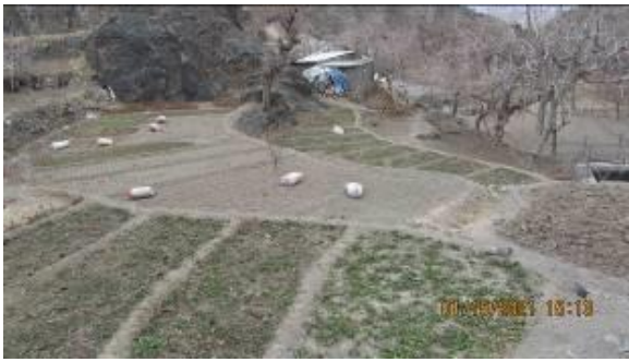
Figure 4. Land fragmentation, peasantry and small holdings as major type of agricultural production system in Razg, Kaseh Sang and Amir Abad Sheybani villages, (7-12 km distance to Birjand city, center of South Khorasan Province, east of Iran) (Pictures by author, January 2021).