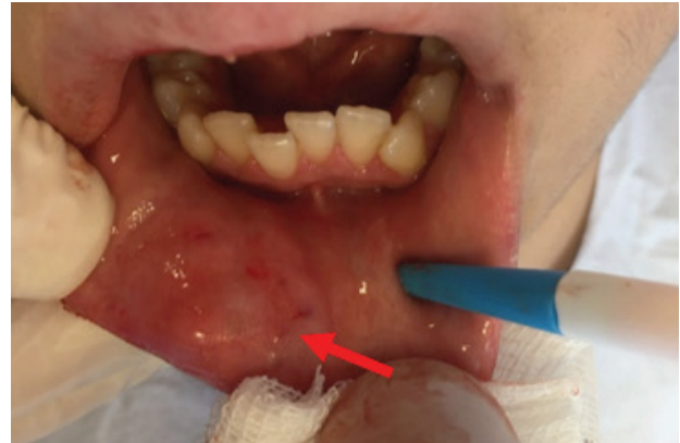
Figure 1. The appearance of the nodular mass detected on the right side of the lower lip mucosa during intraoral examination of the patient.

before the surgical procedure. The lesion was surgically excised completely under local anesthesia (Figure 2,3,4,5). For the definitive diagnosis and histopathological evaluation of the lesion, 7 x 8 x 9 mm excised piece of tissue was sent to the Department of Pathology. As a result of histological and immunohistochemical examinations, the lesion was diagnosed with mucocele. The patient was informed and followed up.