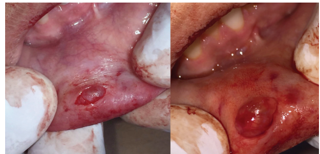
Figures 2 and 3. Intraoperative photographs of the oral mucocele.