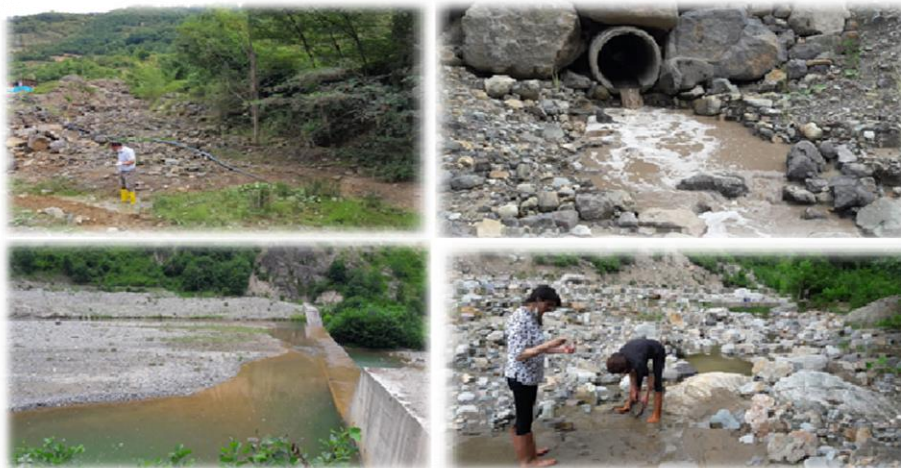
Figure 2. Habitats of the insects and their collection

In the laboratory, the aquatic insects were separated from clayey and muddy substances with the aid of a small paintbrush then they were identified with the aid of a microscope to the species level. Identification was carried out using aedeagophores and some other important morphological characters of the beetles.