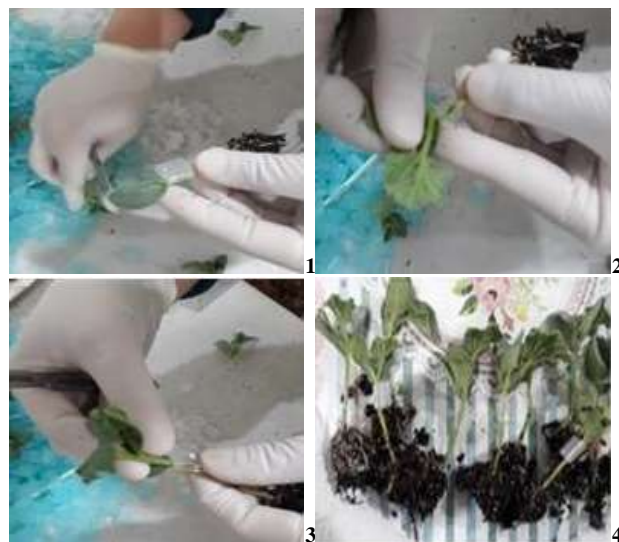
Figure 1. One cotyledon grafting: (1) cut the rootstock at a 60° angle with one cotyledon remaining on the plant; (2) cut the scion at a 60° angle from below the cotyledons (its diameter matches that of the rootstock) (3) attach cut scion and rootstock stems together; and (4) secure the graft with a grafting clip

Grafting was done when rootstocks seedlings had one true leaf and scion seedlings had two true leaves. The rootstock was cut at an approximately 60° angle [21] and one cotyledon remained and one was removed. The remaining cotyledon was meticulous cut to keep hardly connected to the rootstock stem. So, the angled cut was also removed from the apical meristem in the remaining cotyledon. All the apical meristem was removed to prevent future shoot growth of the rootstock. After, the scion was cut at an approximately 60° angle from below the cotyledons. The diameter of the cutting scion was made to suit the diameter of cutting the rootstock (Figure 1).