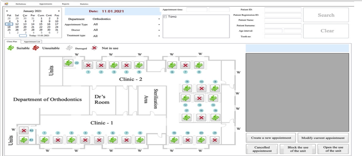
Figure II. Web based online patient appointment software. (W: Windows).