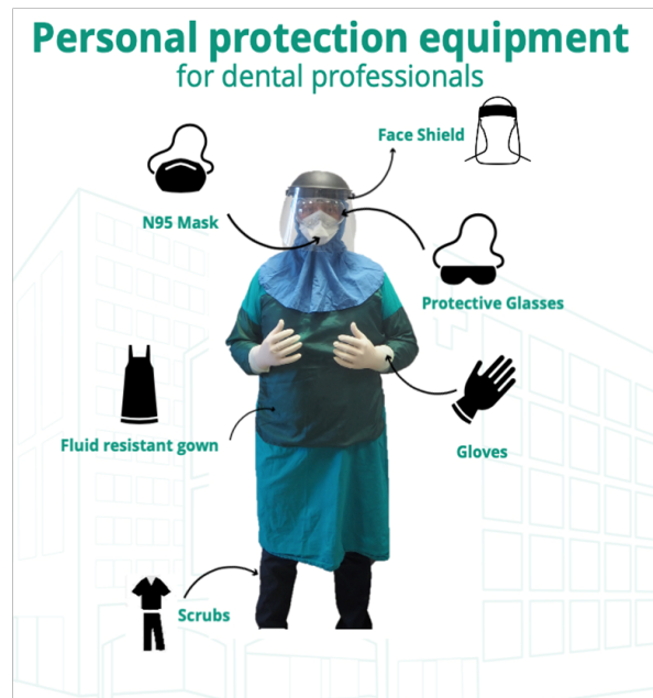
Figure IV. Personal protective equipment of dentists and dental staff.

The data was analyzed with Minitab 17 (Version 17, Minitab Inc., State Collage, Pennsylvania, and USA) statistical analysis program. Fisher's Exact test was used to