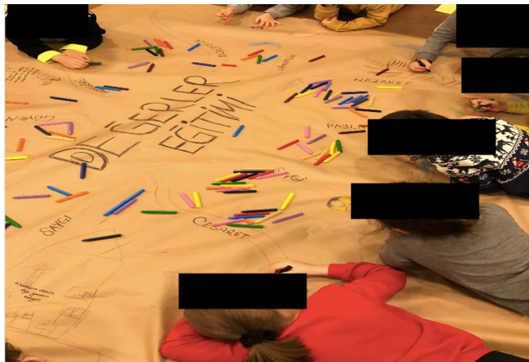
Figure 3. Mind mapping activity themed teaching of values

The last week aimed to reveal the knowledge regarding values learned by the children in the previous 15 weeks. Following the formation of mind maps on all themes, the whole class combined eight pieces of craft paper and made a large group mind map themed “Values” (Figure 3).