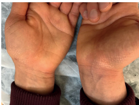
Picture 1. In dermatological examination, hard, bright yellowish-white, keratotic, merging papules were observed on the hypothenar, thenar, inner surfaces of the bilateral hands

A 43-year-old female patient presented with white asymptomatic papules on her hands that became evident due to long-term water contact. In dermatological examination, hard, bright yellowish-white, keratotic, merging