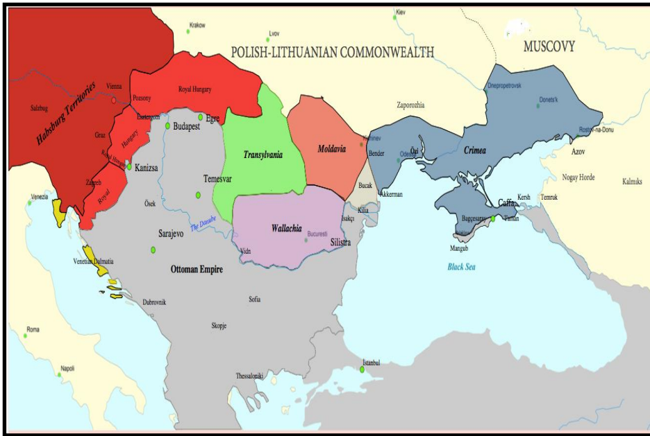
Map 1: Ottoman Provinces and Tributaries in Europe

troops on the Ottoman side of the Habsburg-Ottoman frontier was about 30.000.