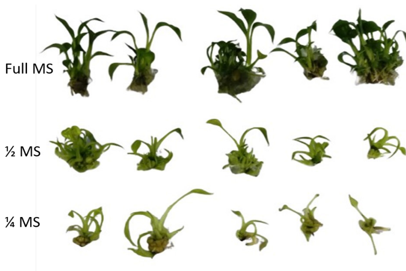
Figure 1. Plants growing in the different strengths (full, \frac{1}{2} and \frac{1}{4} ) of MS media containing 1 \text{ mg L}^{-1} BAP