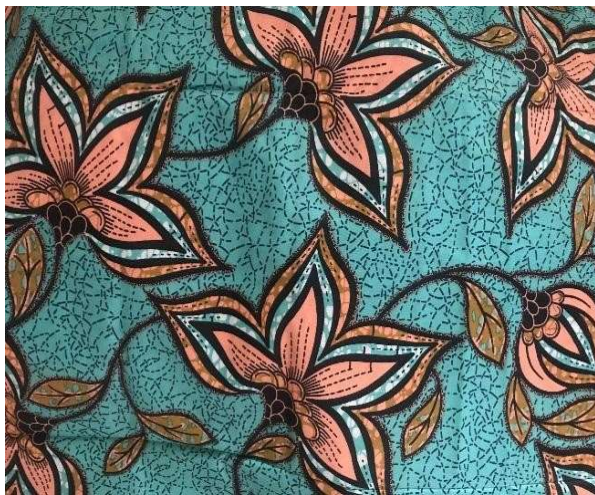
Figure 1. African print fabric 1

African print fabrics today also increasingly incorporate Western objects and symbols such as umbrellas, phones, electric fans, cameras and radios are often overlaid onto backgrounds with lines and other geometric shapes (Amankwah & Howard, 2013; Chichi et al., 2016). Uqalo (2015) noted that African prints are used by people across all social strata including entertainers, religious leaders, politicians and peasants in Africa and the diaspora. Figure 1 and Figure 2 are examples of African print fabrics.