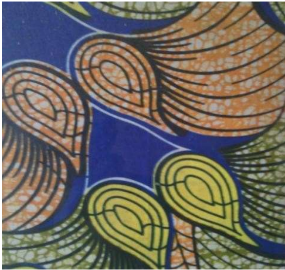
Figure 3. Splattering Wax Effect