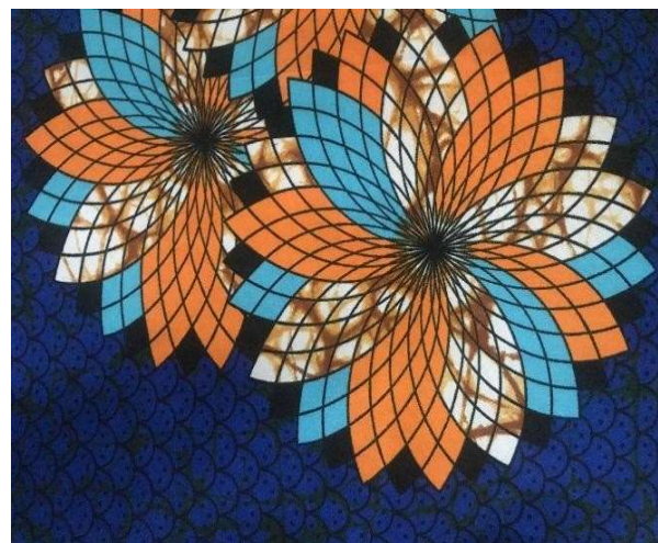
Figure 2. African print fabric 2