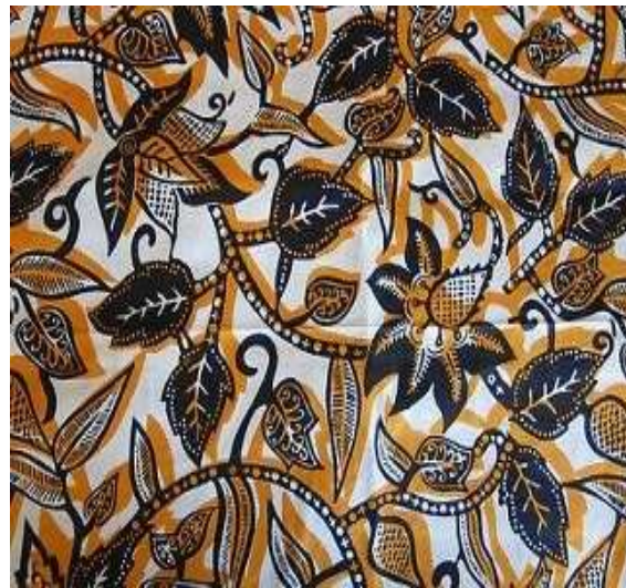
Figure 4. Overlapping Colours Effect