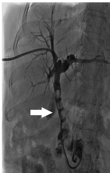
Figure 3. Failed percutaneous treatment due to large stones (marked with the arrow) in the common bile duct.

The median number of failed ERCPs was 1 (1-6). The reasons for failure were impacted stones in nine patients, failure due to previous gastroenterostomy in seven, inability to clear the stones because of large size and/or multiple stones in six, and papillary opening anomaly in one. The main reason for trying ERCP in previous gastroenterostomy group was that the type of gastric surgery (Billroth 1 or 2) that had been performed a long time ago at another center was not clearly known. After failed ERCPs, treatment via percutaneous transhepatic catheter was tried in seven patients. In five of these, the stones could not be removed or pushed into the duodenum because of their large size (Figure 3), one could not be adequately positioned due to scoliosis, and in one, intrahepatic bile ducts were not dilated enough and the procedure was failed.