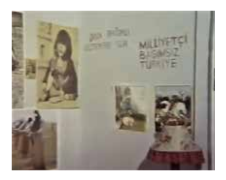
Resim 4: "Güneş Ne Zaman Doğacak" adlı filmde dışa karşı umut inşasının eleştirildiği sahnelerden birisi (Kılıç, Güneş Ne Zaman Doğacak, 1977).