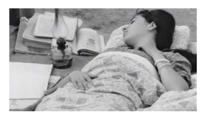
Picture 15: The girl tries to study in the light of the kerosene lamp. (Güney & Gören, Umut, 1970).