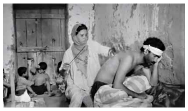
Picture 13: The poor who cannot go to the doctor try to treat themselves at home. (Güney & Gören, Umut, 1970).

In the 1970s, a paradox was experienced in professions such as horse-drawn carriage and phaeton driving. As motor vehicles become widespread, it can be thought that this type of professions will end. However, those who practice such professions have nothing to change the professions in question. Unemployment is increasing day by day in the country. High inflation and high cost of living affect the whole country. All of this hits those who do this type of professions the most. These people quickly move away from earning a living income. In fact, the movie "Umut" is the story of poverty rather than the story of a charioteer. It is the story of the destruction on society of not having a certain income or the rapid melting of incomes. Cabbar can't even feed his horse. The horse was emaciated. On the other hand, it is very important for Cabbar's friend to say to him: "Any job is good when you have money. When you have money, you eat kebab, you eat dessert, you drink, you sleep in bed. When a man has money, he becomes strong. When a man has money, he has a house, and house turn to home. At home, the pot is boiling, they have children. If you don't have money, there is no worse than you. They chase you from everywhere. The face of the poor is cold. If you have money in your pocket in the coldest time of winter, you will not be cold. You sweat like you're in a Turkish bath. If you don't have money, you will be cold on a summer day. Because money keeps a man warm."