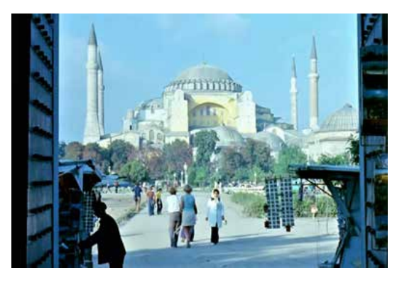
Resim 40: Hagia Sophia. (Çakmaklı, 1970).