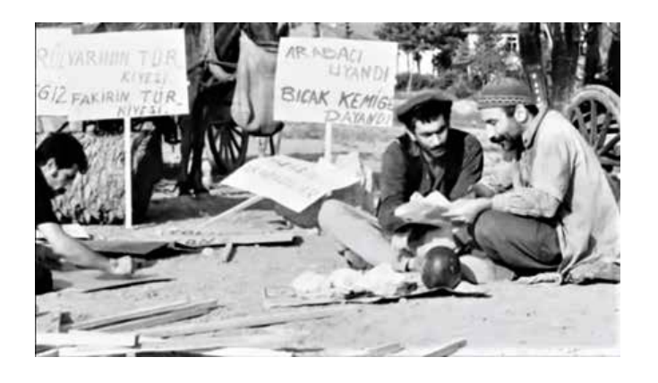
Picture 11: Horse-drawn carriages protest the municipality's r emoval of carriages (Güney & Gören, Umut, 1970).