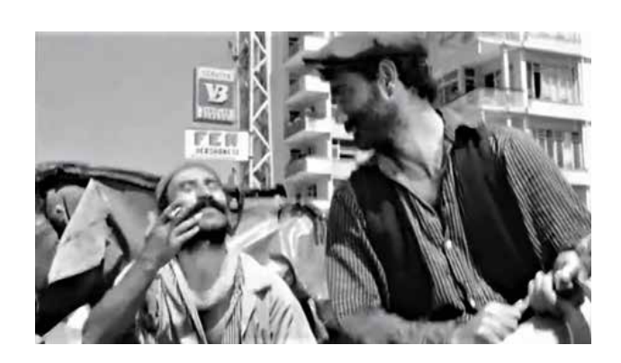
Picture 20: Private school and bank ads. (Güney & Gören, Umut, 1970).