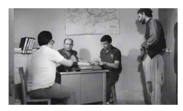
Picture 2: A distinction is made at the police station by making the upper-class person sit down and the lower-class person standing. (Güney & Gören, Umut, 1970).

In the 1970s, in the face of the weight of social, political and economic problems, "hope" was brought before people as a concept that would never be eroded. As the economic and social problems worsen, the hope of foreign aid by the rulers of the state increases. In particular, aid from the United States of America is very important here. In terms of foreign aid, Russia's name begins to appear more and more as a result of the strained relations with the United States and the embargo imposed on Turkey after Turkey's intervention in Cyprus in 1974. On the other hand, in the face of increasing problems, it can be stated that some political groups in Turkey argue that the political regime of the state should be as the regimes in the USSR or China. It is seen that the USA, the USSR or China are brought before people as hopes for Turkey to overcome its economic and political problems. It is seen that this construction of hope was criticized in some films shot in that period (Kılıç, Güneş Ne Zaman Doğacak? 1977).