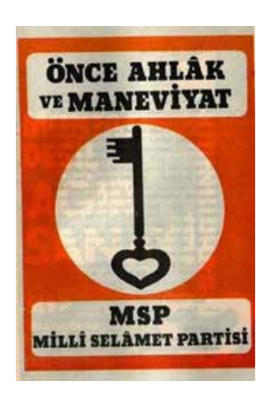
Picture 24: It is one of the posters used by the National Salvation Party in the 1977 Elections and emphasizing morality.

Against the morality problem in many areas in Turkey, the National Salvation Party will develop an idea or slogan such as "morality and spirituality first". According to the founders of the party, one of the ways to achieve this is religious education (Asiltürk, 2018). In line with this idea, this party will try to spread religious schools throughout Turkey during the periods when it is in power (Kıratlıoğlu, 2018). Efforts will be made to disseminate the idea in question through publications such as books and magazines. Press and cinema are other ways to reach the society. In this sense, the novel "Huzur Sokağı" is important here (Şenler Ş. Y., 1970). This book has a different meaning for people in the line of the National Salvation Party. This situation remains strong for a long time.