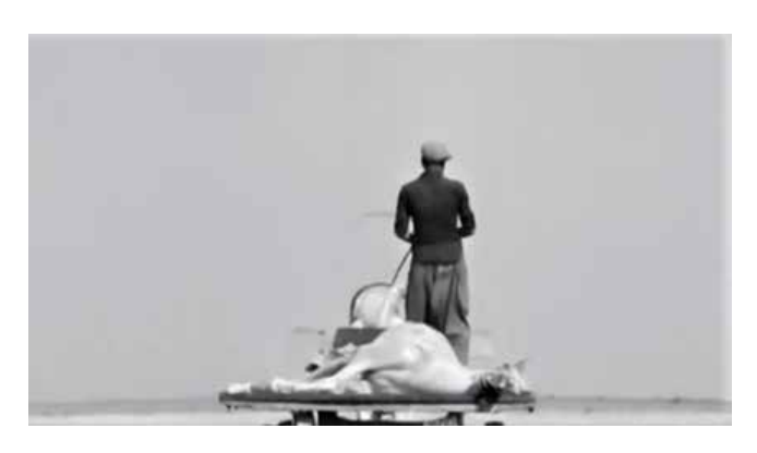
Picture 10: In the picture, it is seen that the horse that died as a result of being hit by the car is taken by a horse carriage. (Güney & Gören, Umut, 1970).