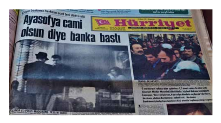
Resim 39: A news about Hagia Sophia. (Hürriyet, 23 Mart 1977).