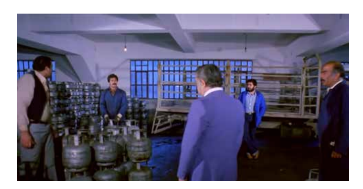
Picture 22: The image shows stockpile of propane cylinder to sell them more expensive on the black market. (Aksoy, İstanbul 79, 1979)