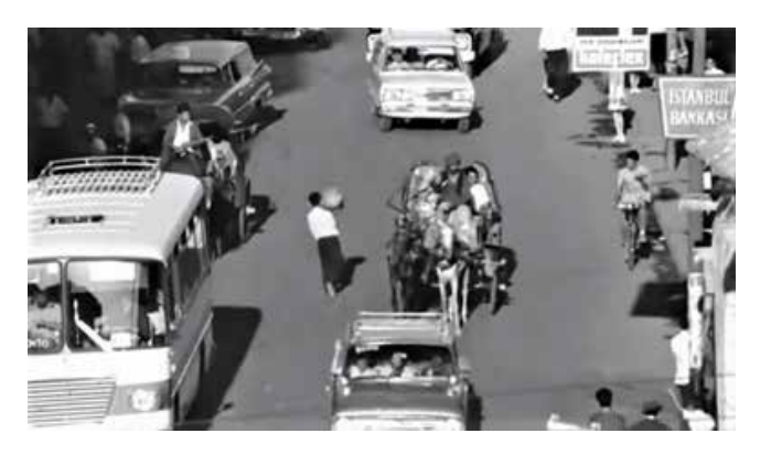
Picture 9: The picture shows horse carriages trying to transport passengers in heavy traffic in Adana. (Güney & Gören, Umut, 1970).

Vehicle density begins to increase in cities and on highways. There is a significant increase in traffic accidents. In the movie "Hope", one of Cabbar's horses is hit by a car. The horse dies. In the following process, horse-drawn carriages and phaetons begin to be seen as elements that endanger traffic safety. Dense flies in cities cause discomfort. In some cities, intense bad smell is felt. Sometimes it is though that these are due to horse feces and urine. Thereupon, local governments try to ban the use of horse-drawn carriages in cities. The protest of owners of horse-drawn carriages to the local governments against such decisions is reflected in the movie "Hope". It is seen that the leftist thought of that day often included protest scenes in movies in order to nurture a protest culture in real life and to invite people to the streets.