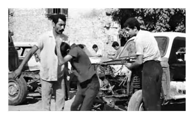
Picture 16: In the repair shop, the boy gets beaten up by his master. (Güney & Gören, Umut, 1970).