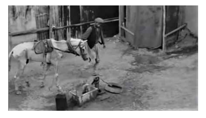
Picture 14: The picture shows a emaciated horse. (Güney & Gören, Umut, 1970).

In the face of poverty, livelihood anxiety increases. The debt to the grocery store and other tradesmen increases too. It is important in this sense that last horse of Cabbar, despite his increasing debt, is seized by the creditors. Children are most affected by the poverty of the family. When the daughter of the house, who tries to study by candlelight, fails at school, she is subjected to violence by her mother. Children fight over a slice of watermelon. They cannot live their childhood to the fullest. Either boy is apprenticed to a place at a very early age or girl is married off at an early age. In the movie "Umut", the child is sent to the grocery store to buy salt with three or five cents that the mother finds by difficultiesLonging for games and toys, this child goes for three or five tours with the bike he obtained from the cyclist who came to his neighborhood with this money in the form of rent. However, the child is hit by his mother. Because there is no other money to buy salt.