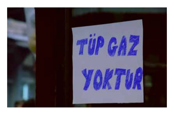
Picture 23: The "No propane cylinder" writing hanging on the shop window. (Aksoy, İstanbul 79, 1979).