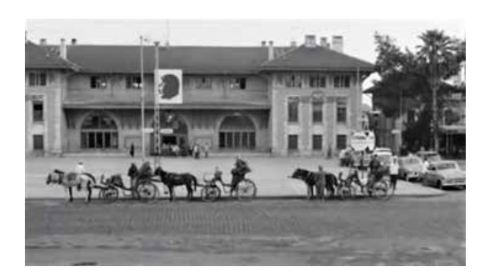
Picture 8: The picture shows phaetons and taxis waiting for passengers in front of Adana train station. (Güney & Gören, Umut, 1970).

Vehicle density begins to increase in cities and on highways. There is a significant increase in traffic accidents. In the movie "Hope", one of Cabbar's horses is hit by a car. The horse dies. In the following process, horse-drawn carriages and phaetons begin to be seen as elements that endanger traffic safety. Dense flies in cities cause discomfort. In some cities, intense bad smell is felt. Sometimes it is though that these are due to horse feces and urine. Thereupon, local governments try to ban the use of horse-drawn carriages in cities. The protest of owners of horse-drawn carriages to the local governments against such decisions is reflected in the movie "Hope". It is seen that the leftist thought of that day often included protest scenes in movies in order to nurture a protest culture in real life and to invite people to the streets.