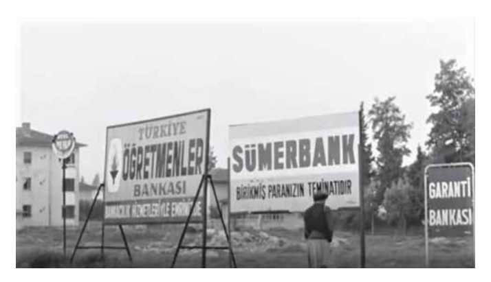
Picture 19: In the movie "Umut", Cabbar is seen urinating under the bank advertisements boards. (Güney & Gören, Umut, 1970).

On the one hand, the cost of living increases, on the other hand, the justice in the distribution of income in the society deteriorates. The difference between classes becomes abysmal. Banks and aghas get more richer with the system (Yeldan, 2014). It is shown in many movies and other media content that the current economic situation increases the hostility between classes. Of course, most of the people who make these movies are left-wing people. According to this idea, happy minorities live in apartments located on newly opened boulevards in cities, and mansions. The poor, on the other hand, are trying to live in too much bad places. Serious deterioration in the education system prevent all children from benefiting from basic education properly. In addition, the number of private schools and commercial institutions called private courses prepare children and youth for exams increases considerably (Konak-II, 2017). Yılmaz Güney portrays the upper classes as corrupt in many of his films (Güney, Arkadaş, 1974). In the movie "Umut", no one from the upper classes and landlords responds positively to the cry of Cabbar, who is crushed under the burden of debt, although he asks them for help.