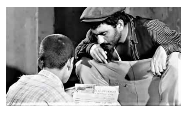
Picture 5: An illiterate poor person has his lottery ticket checked. (Güney & Gören, Umut, 1970).