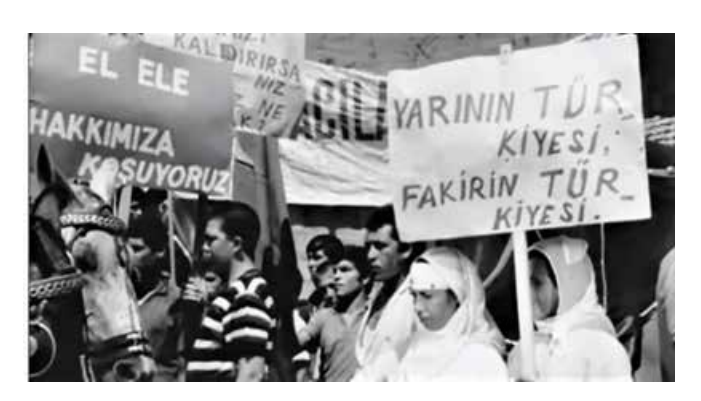
Picture 11: Horse-drawn carriages protest the municipality's r emoval of carriages (Güney & Gören, Umut, 1970).