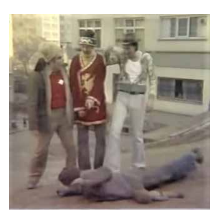
Picture 3: In the movie "Güneş Ne Zaman Doğacak?", Turkey's lying on the ground and asking for help from the USA, USSR and China is represented (Kılıç, Güneş Ne Zaman Doğacak, 1977).

In the 1970s, in the face of the weight of social, political and economic problems, "hope" was brought before people as a concept that would never be eroded. As the economic and social problems worsen, the hope of foreign aid by the rulers of the state increases. In particular, aid from the United States of America is very important here. In terms of foreign aid, Russia's name begins to appear more and more as a result of the strained relations with the United States and the embargo imposed on Turkey after Turkey's intervention in Cyprus in 1974. On the other hand, in the face of increasing problems, it can be stated that some political groups in Turkey argue that the political regime of the state should be as the regimes in the USSR or China. It is seen that the USA, the USSR or China are brought before people as hopes for Turkey to overcome its economic and political problems. It is seen that this construction of hope was criticized in some films shot in that period (Kılıç, Güneş Ne Zaman Doğacak? 1977).