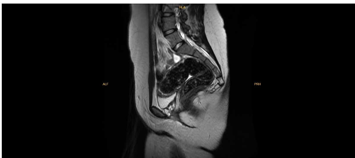
Figure 2. T2 sagittal magnetic resonance imaging view of pelvic cavity demonstrating uterine, cervical and vaginal agenesis.