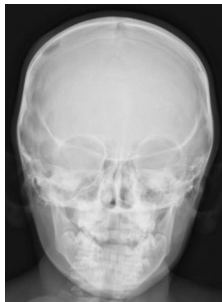
Figure 1: Plain radiography showed a punched-out, lytic lesion on the right parietal region.

irregular lesion with intra-and extracranial extension that had an intermediate signal intensity and demonstrates marked enhancement. The base of the lesion rested on the dura mater provoking menigeal enhancement (Figure 3). Whole body bone scintigraphy showed no bone lesion except right parietal region (Figure 4). Her blood examinations revealed no pathological findings. A gross total excision of the lesion and the surrounding healthy bone tissue borders of 1 cm was performed. It was perforating the whole diploe and part of the dura mater. We excised a piece of a dura mater where the lesion adhered. Then we performed cranioplasty with titanium patch. Histopathological examination of the lesion showed eosinophilic granuloma with cellular components of langerhan cells, chronic cellular infiltrate and eosinophils. Limited infiltration was detected in the surrounding healthy bone tissue (Figure 5). We did not perform any adjuvant therapy for the patient. She recovered well. Control CT of the brain depicted no further recurrence after one year (Figure 6).