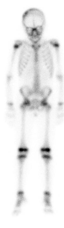
Figure 4: Bone scintigraphy showed no bone lesion except right parietal region. Scintigraphy showed increased osteoblastic activity on the right parietal region.

over the normal levels (5). In the presented case, blood tests of the patient were in the normal range.