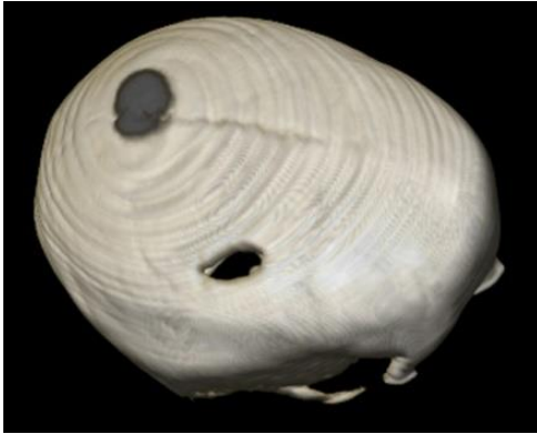
Figure 2: CT clearly showed bone destruction