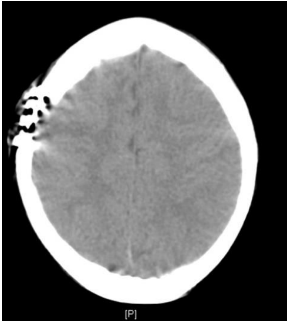
Figure 6: Control CT showed no recurrence in the postoperative period of one year.

the tumoral soft tissue. In this presented case, MRI showed intra and extra-cranial extension of the tumoral tissue. Therefore MRI was the most important radiological examination in determining the treatment strategy. It is important to detect the presence of multiple bone lesions in eosinophilic granuloma (6). We used radionuclide bone scan to detect an other foci point. Radionuclide bone scan didn't show any other bone lesion in this case.