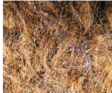
Oil palm fibre