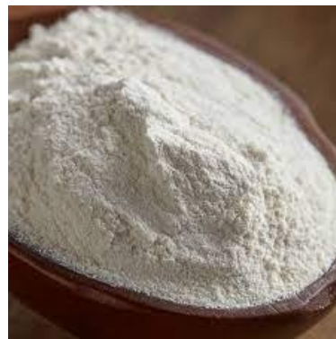
Figure 2. Starch

Three sound attenuation panels of thickness 20, 40 and 60 mm were produced from the five agro-waste materials considered in this study. Table 1 shows the proportion composition of the raw materials used to fabricate the sound attenuation panels. The variation in the agro-waste and the starch quantity depended on the materials' mould thickness.