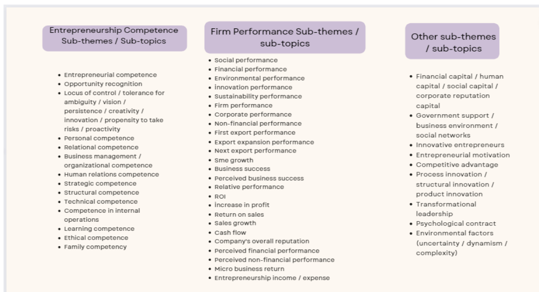
Figure 3. Sub-Themes In The Relationship Between Entrepreneurial Competence and Firm Performance

In the evaluation carried out in the context of sub-themes, the subjects that were mainly addressed are expressed as follows. However, when viewing the sub-themes that are the most common research subject, in the context of entrepreneurship competence, it is considered that opportunity recognition competence, entrepreneurial competencies, relational competence, conceptual competence, business management competence, technical competence, personal competence, and strategic competence are viewed as sub-themes. The most frequently researched topics in the context of company performance are firm performance, institutional performance, financial performance, non-financial performance, innovation performance, SME success, business success, and perceived business success.