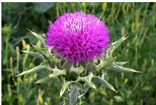
Fig. 1 Silybum marianum L.

Silybum marianum L. (Figure 1) are cultivated in the region from Southern Europe to Northern Africa, as its seeds have medicinal potential. The primary purpose of its cultivation is the extraction of silymarin, which is used to cure liver diseases, from its edible seeds. Silybum marianum seeds contain many flavonolignans. The main active compound in the seeds is a flavonoid known as silymarin, which is widely used to regenerate damaged liver tissues. Many research have indicated silymarin's efficacy in chemoprevention and hepatoprotection [1], [2].