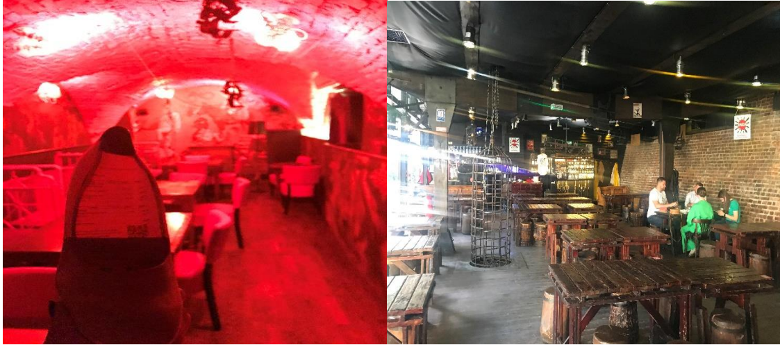
Figure 2. The lower floor service hall of Masoch cafe, and bringing a bill in a woman's shoe (left). A torture device (iron cage) used for entertainment in the Meat and Justice restaurant (right).

In the observations within the research, it has been seen that the themed restaurants attempt to offer their customers enjoyable experiences. Starting from the external appearance of the restaurant (guest welcoming and entrance) to taking orders and bills, shows during the meal, employees' clothes and setups, astonishing service ways (such as serving coffee with fire in the dark) aim to entertain the customers in general. Of course, such activities offer much more fun than a typical restaurant can do, and such restaurants can turn into entertainment centers for tourists. Below are some photos of the activities of the theme restaurants to entertain their customers.