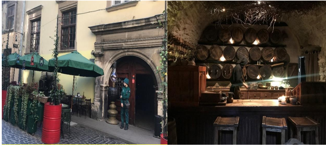
Figure 3. Gasova Lampa (Gaslamp) restaurant entrance and waiting staff (left), a staff member in Medieval age clothing at the 5th Dungeon restaurant (right).