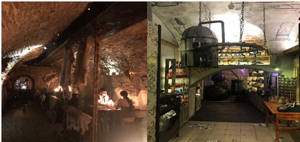
Figure 1. A part of 5th Dungeon service hall (left), Souvenir section of Gas Lamp restaurant (right).

Observations during the research also show that the atmosphere of themed restaurants provides memorable experiences. In fact, tourists' conversations, reactions (such as being surprised, tone of voice), and photographs or video recordings in the restaurants express their astonishment about the atmosphere. Below are the photos reflecting the atmosphere of the two restaurants that customers frequently highlight.