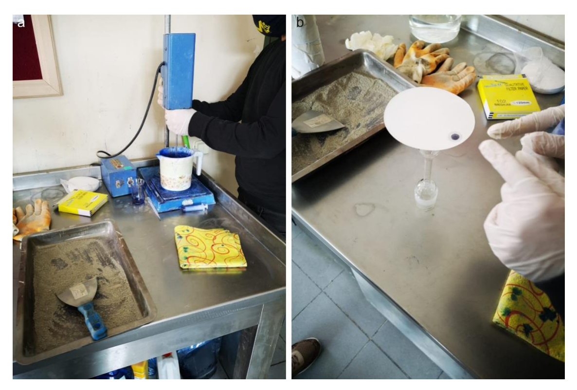
Figure 7. The methylene blue test on investigated aggregates.

This test was carried out to determine the methylene blue index (MB) of fine aggregates and carried out in accordance with TS EN 933-9 standards. The methylene blue test is used to determine the amount of clay in the aggregate. The maximum value specified in this test, which only applies to fine aggregates, is 1.5%. The material above this value is considered to contain too much clay and cannot be used in the production of concrete. The value of methylene blue, which is the expression in grams of the dye consumed per kilogram, was found to be 25 ml for the Seydiköy village aggregate and 15 ml of methylene blue solution were sufficient to detect the presence of clay in the limestone sample from the Capar village quarry (Figure 7).