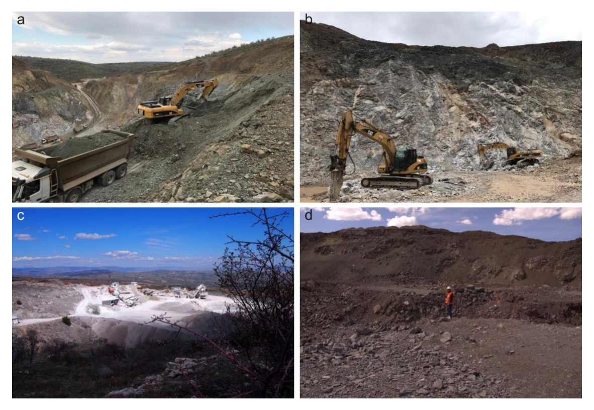
Figure 5. a, b) Views of the Capar village quarries; c, d) Views of the Seydiköy quarries.