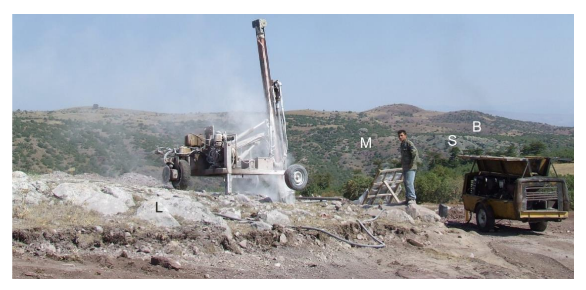
Figure 3. The blocks of Ankara Mélange (B: basalt, L: limestone, S: serpentinite, M: mudstone)