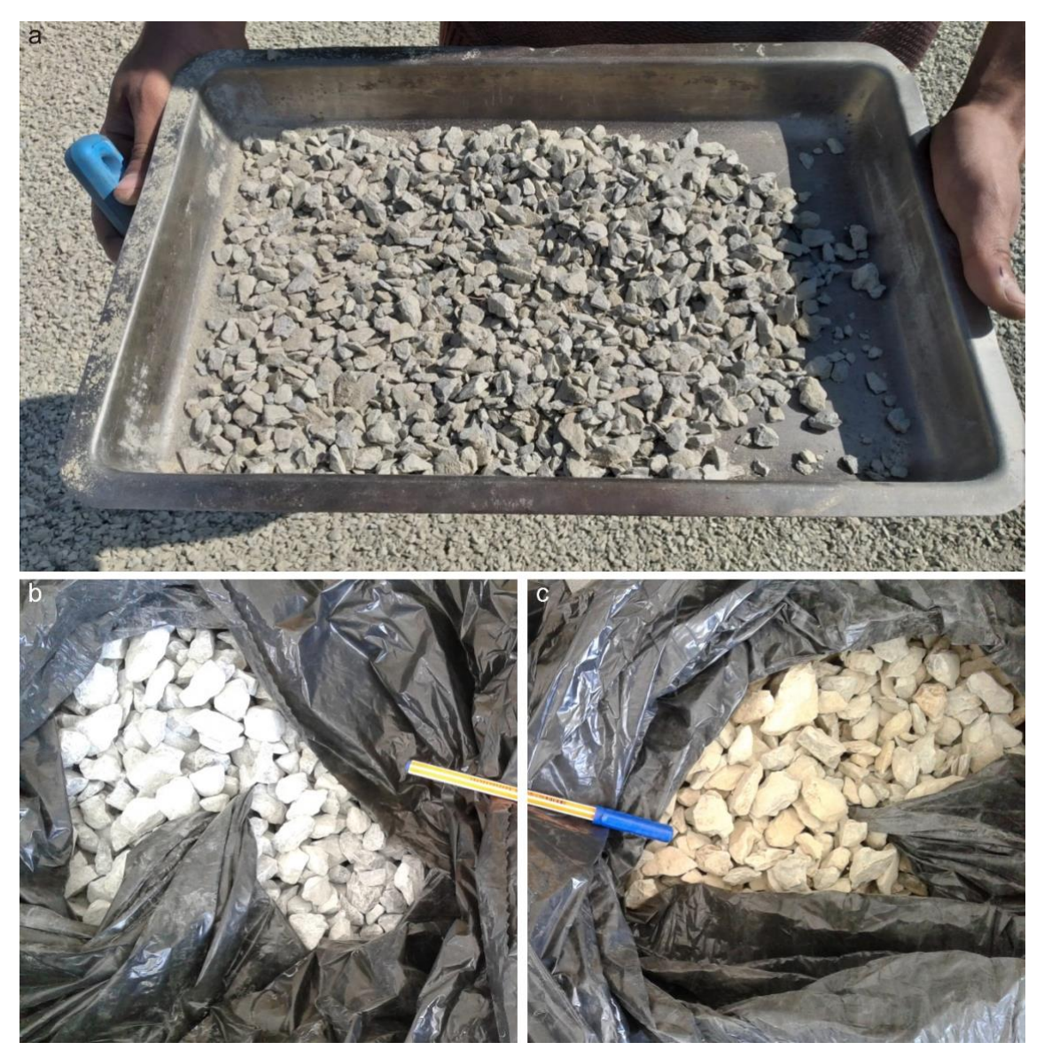
Figure 4. a ) E-1 (Limestone aggregates from Ṣabanözü); b ) E-3 (Limestone aggregates, Doğu district, Korgun); c ) E-2 (Limestone aggregates from Eldivan)