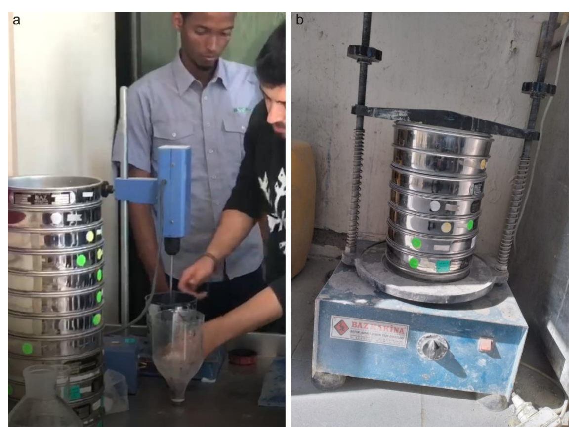
Figure 6. Sieve analysis for determining the particle size distribution.

The aggregate pile contains grains of varying sizes. Granulometric or sieve analysis is used to evaluate how an aggregate pile should be arranged based on grain size (Figure 6). The granulometric composition indicates the percentage of the aggregate material whose dimensions are within certain limits. Granulometry has a great influence on concrete compaction, strength, durability and the volume of mixing water.