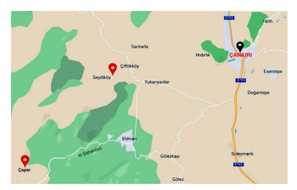
Figure 1. Location on the Seydiköy and Çapar quarries.

the quarries are located, are gray-light gray in color or light pinkish gray in color and have a massive appearance. It is cracked-fractured or karst cavities in places.