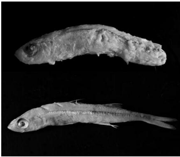
Figure 2. A. boyeri specimens found in stomach content of P. fluviatilis . Lower case indicates almost an intact A. boyeri specimen, probably just shortly before captured by the predator while the specimen in upper case was in a slightly advanced state of digestion.

The present study was originally initiated with the aim of understanding food habits of perch, Perca fluviatilis Linnaeus, 1758 in the reservoir and fish samples were collected between March 2009 and April 2010. A total of 428 perch was captured by using gillnets having different mesh sizes (10×10 mm, 20×20 mm, 30×30 mm, 40×40 mm and 50×50 mm). The gastrointestinal tracts of 81 P. fluviatilis specimens were examined to determine the dietary components. Unexpectedly, two A. boyeri specimens were found in stomach contents of two different P. fluviatilis specimens captured in October and November 2009. The perch specimens were 13.8 cm total length (38.62 g) and 25.4 cm total length (268.00 g), while A. boyeri specimens were 8.6 cm total length (2.12 g) and 6.1 cm length (because this sample was digested to some extent, only current length was given) (1.75 g), respectively (Figure 2).