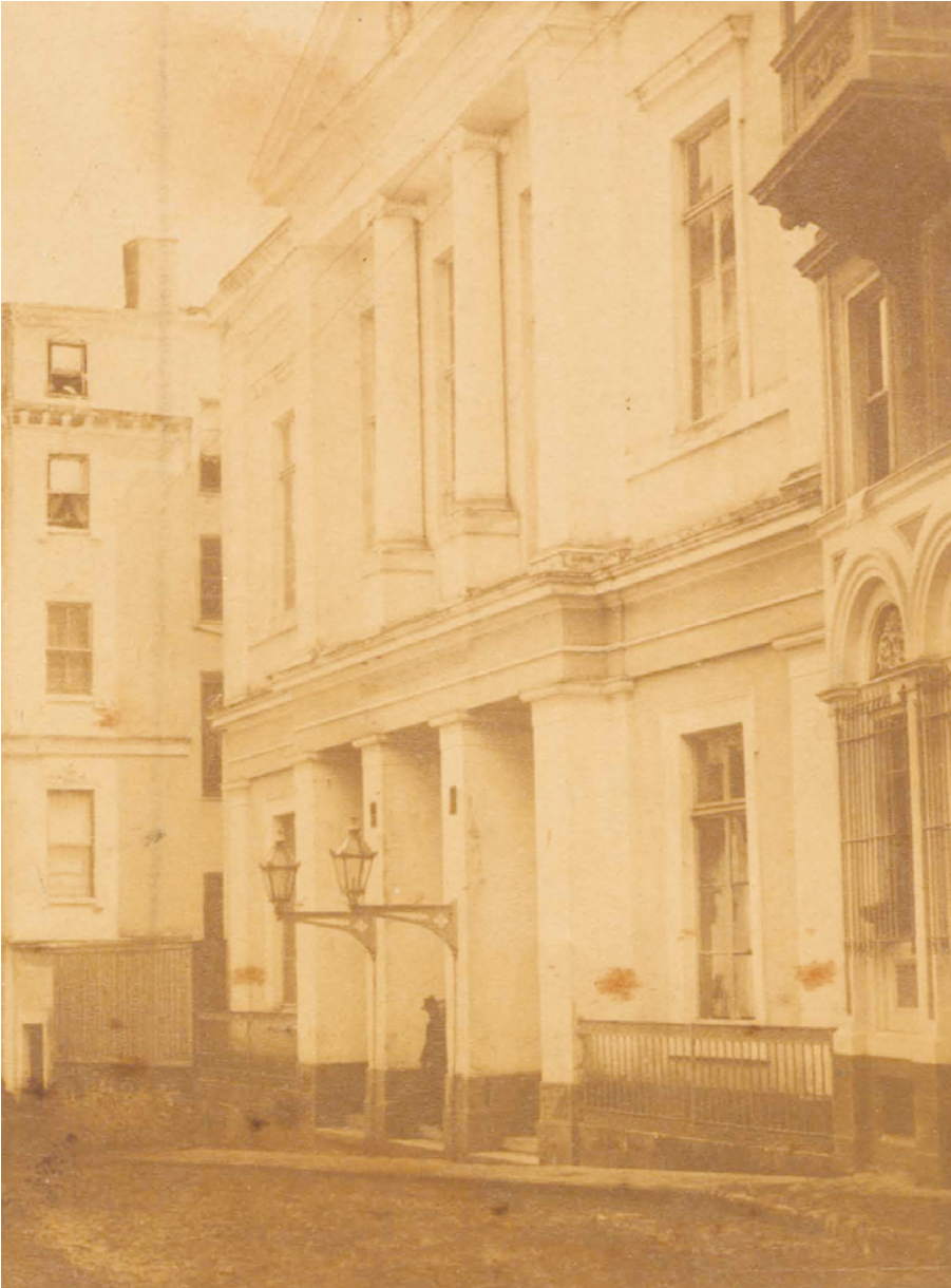
Figure 1: The headquarters of the Hellenic Literary Society at Constantinople (En Κωνσταντινουπόλει Ελληνικός Φιλολογικός Σύλλογος, Σύγγραμμα Περιοδικόν, annex to vol. ΙΗ', 1888, 4). University of Crete – Rethymno. Digital Library of Modern Greek Studies.