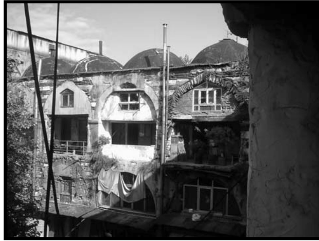
Figure 6. Additional rooms in the porticos of Balkapanı Inn (17 th yy) [3]