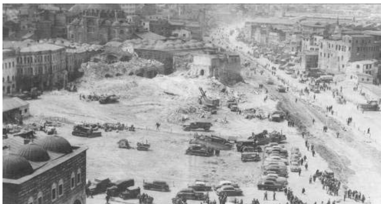
Figure 3. Eminonu Square in 1945

The unplanned development of cities and the construction of excessively tall buildings made possible by the granting of building rights within the framework of new urban plans has had a detrimental effect on historical buildings and resulted in their disappearance from the urban fabric. The construction of tall buildings around the inns of Istanbul led to their elimination from the city's skyline, and the increase in the density of buildings has led to the widening of the narrow streets where the inns are located. Furthermore, increases in sound pollution and the introduction of undesirable foreign elements have had a negative impact on the visual unity of the historical surroundings and the harmonious effect of the setting.