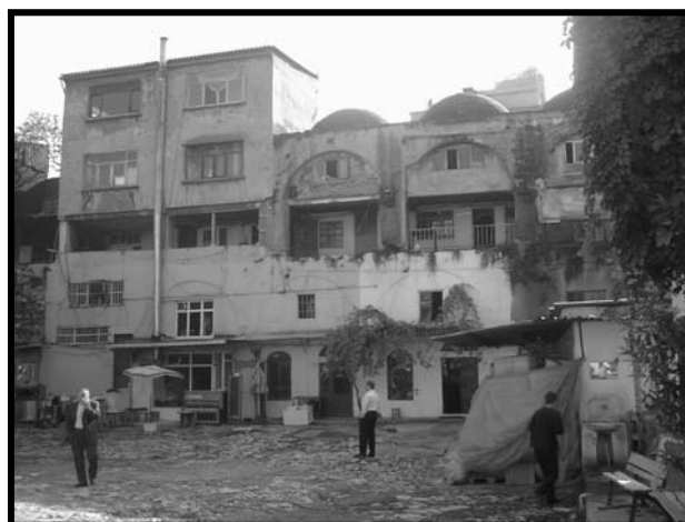
Figure 5. Mezzanine floors in Balkapanı Inn (17 th yy) [3]

The random construction of mezzanine floors, the building of dividing walls, the opening of display spaces in facades facing the street and the construction of new entrances have resulted in rapid changes in the inns. A mezzanine floor, added to the second-story colonnade at an inn to increase the space, was built all the way up to the steel tie rod which was then used to support its weight. It has been noted that entire walls have been removed so that large machines could be brought into inns that are used as workshops and it is thought that the vibrations created by those machines have further strained the structure of the buildings themselves. Such uses of inns have been detrimental to their original structure and led to structural damage such as cracks, separation, collapses and crumbling.