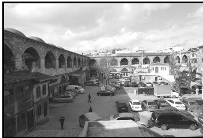
Figure 7. Cars in the courtyard of Vezir Inn (17 th yy) [3]

Due to the fact that there aren't any parking lots in the district, the courtyards of the majority of inns are used as parking areas and delivery trucks bringing and picking up goods enter the courtyards as well. The tremors created by such vehicles as they come and go has a negative impact on the buildings of the inns. In addition, the streets in the district aren't broad enough for the large amount of vehicular and foot traffic, leading to yet another negative situation, along with the problems created by the loading, unloading and storage of goods. Because the district is not residential, at night it is rather empty, thus leading to problems of security; additionally, the grounds in the area aren't looked after and are unkempt (Figure 7).