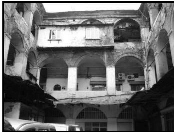
Figure 4. Additional rooms in Buyuk Yeni Inn (17 th yy) [2]

Such additions were initially made with materials that could easily be removed, but those were later reinforced with more permanent materials such as fired bricks and brick blocks. Over time, new additions have been made on top of those as well. Such additions occupy the central courtyard area, blocking off the structure of the building. It has been found that the owners of the properties, seeking to enlarge their space, have detracted from the architecture of the inns by adding mezzanines on the upper floors of inns, as well as building mezzanine floors in colonnades, knocking down walls to join rooms, blocking off colonnades and building additional rooms in corridors, and building rooms against the facades of the courtyard walls which have in some cases been plastered over and painted (figure 4). The creation of additional rooms by blocking off colonnades and the creation of corridors between them makes it difficult to recognize the colonnades for what they are.