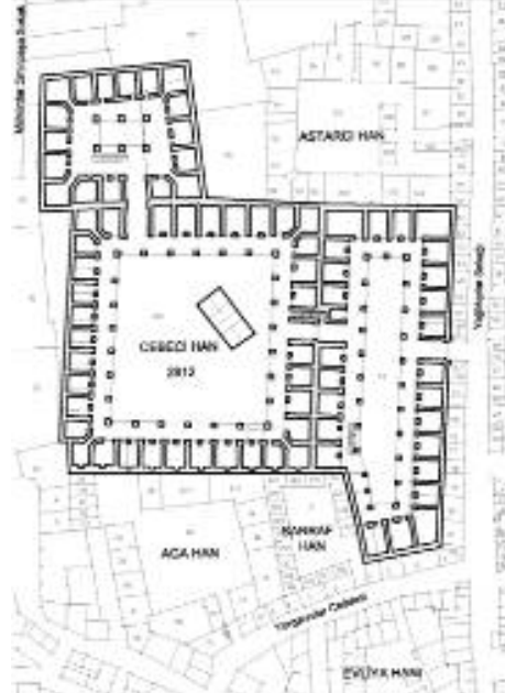
Figure 2. Cebeci Inn (17 th yy), ground floor plan [2]

significant number of these inns are used for both the production and sale of traditional commercial items such as handmade toys, dyed fabrics, inlaid mother of pearl, calligraphy, marbled paper, hand-woven goods, embroidery, baskets, wooden boxes, hookahs and pipes. In the 18 th century, there was no longer room in the Inn District for the construction of inns with large courtyards so fewer of them were built. During and after the 19 th century, inns were built on smaller plots of land but were taller due to the introduction of new building technologies that employed concrete and steel. In that century, we begin to see inns that are four and five stories tall, but their inner courtyards are no longer open to the sky as they were transformed into enclosed areas accessed by stairs.