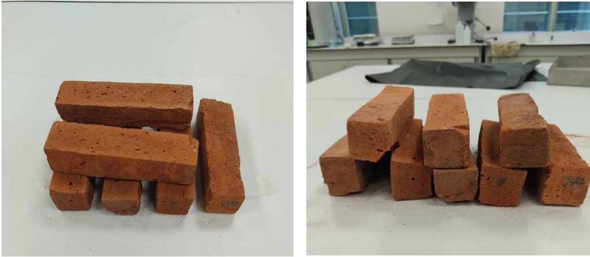
Figure 1. Produced geopolymer brick samples

After the cooking process, the samples were allowed to cool slowly in the oven. It is not removed from the oven immediately after cooking because there are no problems on the samples, such as calama or breakage caused by sudden temperature changes.