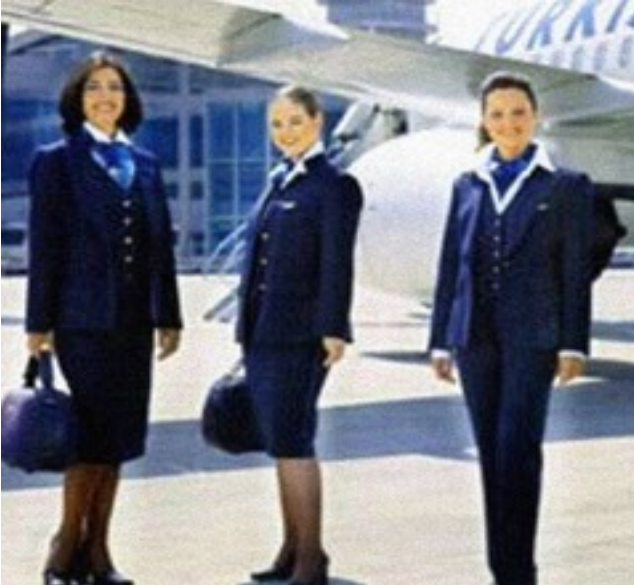
Picture 20: Turkish Airlines stewardesses' uniforms designed by Vakko. 1998