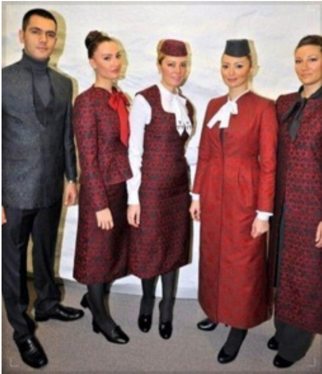
Picture 25: Turkish Airlines stewardesses and uniforms sketch designed by Dilek Hanif, 2013

With the AKP government coming to power and Turkish Airlines' privatization, it is possible to talk about a complex national identity for Turkish Airlines. Turkish national identity is represented in different forms, including Muslim, Anatolian and western.