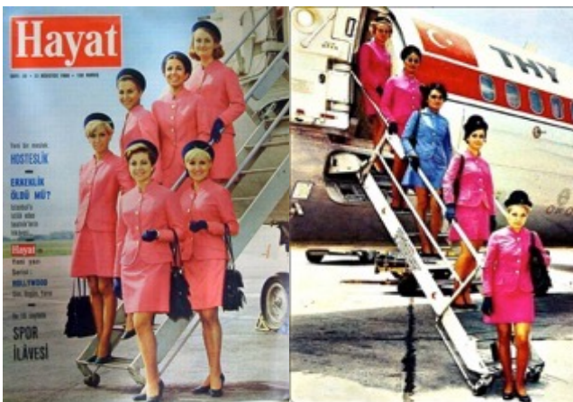
Picture 6-12: Turkish Airlines stewardesses with pink uniforms 1968-1973