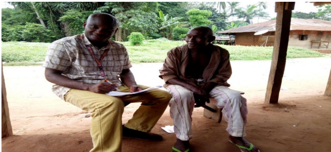
Figure 2. Researcher with one of the locals' (household head) in Ogbekpen Community

communities were chosen principally because of their vulnerability to bushfire occurrence owing to their livelihood activities. In addition, these communities have close proximity to the Rubber Research Institute of Nigeria (RRIN) where the rubber plantations are located. The respondents for the questionnaire were heads of households which are predominantly local farmers from the neighboring communities and laborers employed by RRIN. The selection of head of household was based on the systematic sampling technique. To acquire data on the perception of bushfire effects on rubber tree height, canopy, DBH and bark, the Likert-type format type of questionnaire was administered to the household heads (Figure 2). Based on the sample size (two hundred), questionnaires allocated were as follows: Uhie (10), Ogbekpen (40), Obaretin (22), Iyanomo (84), Obayantor 1 (22) and Obagie (22). Personal discussions with the sampled locals' were also used to elicit information for this study.