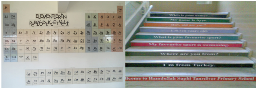
The European Union/Comenius theme was the rarest theme in the photos taken