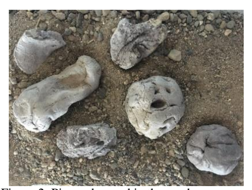
Figure 2. Pieces dropped in the sand

Elaboration: During the exploration phase, the largest pieces scattered around by the impact of collision are selected and left on the sand in a transparent bucket from afar. The shapes formed on the sand are evaluated in terms of size and depth.