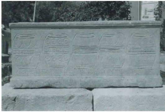
Fig. 8. Gladiator Sarcophagus, Antalya Archaeological Museum (İşkan 2002, Pt. 381)

relief of Kayabaş as headdresses symbolizing the Dioscuri, as observed in examples from the immediate vicinity and in the broader region. In this perspective, it is fitting to consider these figures, symbolizing the Dioscuri, as protectors of the graves with their divine identities and as beings that sanctify the burial site. Nevertheless, while the headdresses of the Dioscuri typically taper upwards in the majority of examples, the Kayabaş figures are completed in a spherical form at the upper end (see Fig. 7). This detail necessitates a different interpretation of the figures' iconography. The figures depicted on the Champion Sarcophagus in the Antalya Archaeology Museum (see Fig. 8) 54 and the figures on a sarcophagus discovered in Selge (see Fig. 9) 55 exhibit a similar form. The resemblance between the Kayabaş examples and the aforementioned forms warrants an alternative perspective in interpreting the iconographic expression.