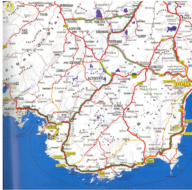
Fig. 2. Kayabaş Neighbourhood

The name of the neighbourhood is derived from the rocky hill upon which it was established. Its topography is predominantly rocky and lacks vegetation. This feature is consistent with the overall topography of the Korkuteli Basin, which is located in the hinterland of the Beydağları Mountains, running parallel to the Mediterranean. The region is characterized by plains and hill formations 1 . Similarly, the Kayabaş Neighbourhood exhibits the characteristics of a Mesozoic Tertiary limestone structure 2 . While the eastern and western parts of Korkuteli are mountainous, the northeast and southwest areas are primarily composed of plains. Notably, the neighbourhood is defined by a stream that passes near Çıvgalar Neighbourhood, resulting in a geography that features wetlands and rugged terrain amidst densely clustered hills. These aspects constitute the most significant features of the area's topography.