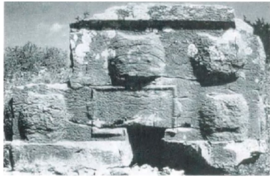
Fig. 9. Sarcophagus with Prize Figure in Relief, Selge (İşkan 2002, Pt. 407)

The presence of a floor-like element (representing a table or trestle) within the niche suggests the presence of objects. In this context, it is plausible to propose that these objects may be award crowns. The owner of the tomb likely chose to emphasize achievements in the field of sports by opting for reliefs depicting award crowns, rather than decorations highlighting their intellectual level and social status, as was common among Lycian aristocrats. The deliberate positioning of this depiction right next to the stele with the symposium scene should not be dismissed as insignificant.