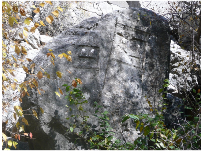
Fig. 3. General View of the Kayabaş Reliefs