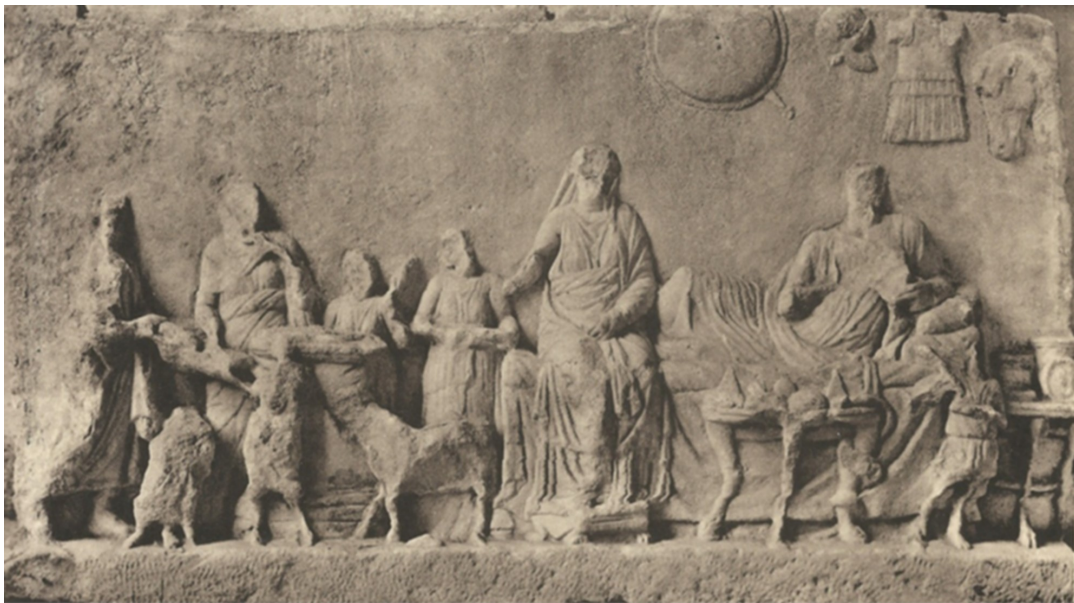
Fig. 5. Grave Stele, Samos (Horn 1972, Pt. 71, Fig. 138; Yaman 2012, Pt. 21a.)

In reliefs depicting symposia, women are often depicted sitting at the foot of the couch or on a separate chair or stool. In the Kayabaş example, an adult female figure is depicted sitting at the foot of the reclining figure on the couch. The figure is depicted entirely from the front, facing forward. Compared to the other figures in the scene, she has a larger depicted body structure. She stands upright with her right arm bent at the elbow and placed on her abdomen, while her left arm rests on it and is also bent at the elbow, holding the edge of the mantle to the left of her chin. Similar to the male figure, the head and facial features of this woman have been damaged due to both natural causes and deliberate defacing. Consequently, the details of the head, hair, and facial features cannot be discerned, but the neck can be observed. Details such as the shoulders, arms, hands, and feet are not visible. The figure stands on the same level as the feet of the couch. A similar depiction to the woman figure in the Kayabaş relief can be found on a Hellenistic grave stele discovered on the island of Samos. It represents a common narrative of the same typology from a different region (see Fig. 5) 17 . The woman is seated at the foot of the couch, depicted from the front and looking across, similar to the stance in the Kayabaş example.