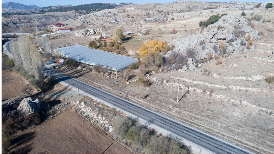
Fig. 1. Location of Kayabaş Relief Rock

the north and east. Extensive research has been conducted on the Kayabaş Reliefs, in order to comprehensively evaluate the surrounding remains and their associations which are considered to be local examples of a broader composition.