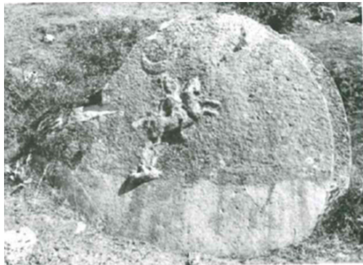
Fig. 13. Kayabaş Round Block, Relief (Coulton 2012)

When the round block was standing, it depicted a male figure adorned in a short tunic and a cloak,