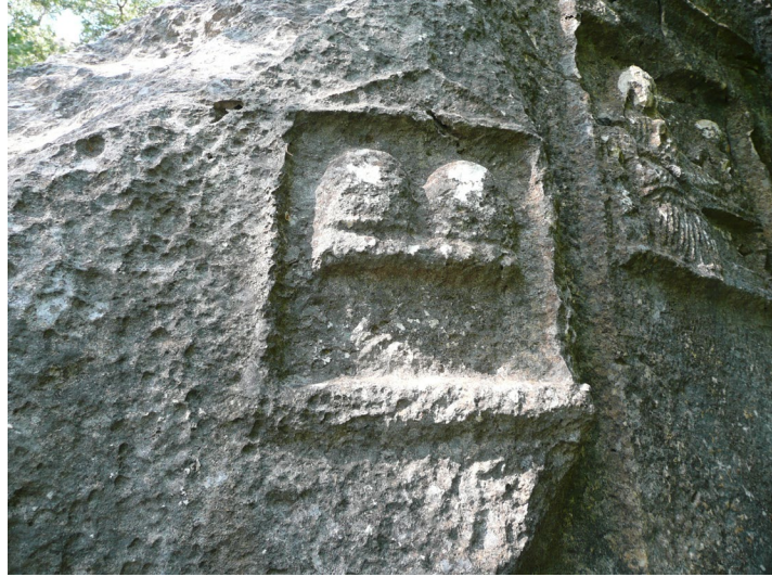
Fig. 7. Kayabaş Second Relief (Award Crowns)

The second relief is situated on the same rock mass as the Kayabaş grave stele relief, specifically to the southwest of the stele relief. The stele relief is positioned 0.32 m above the baseline and 0.09 m to the west. Being smaller in size compared to the figurative relief, it was not adjusted to the natural slope of the rock mass on which it is located. When viewed from the opposite side, it becomes evident that it was carved vertically to the ground in proportion (see Fig. 7). Given its location and proximity, it is directly associated with the stele relief featuring a symposion scene. The reliefs within the same space are depicted in a cohesive manner, exhibiting a sense of unity 52 .