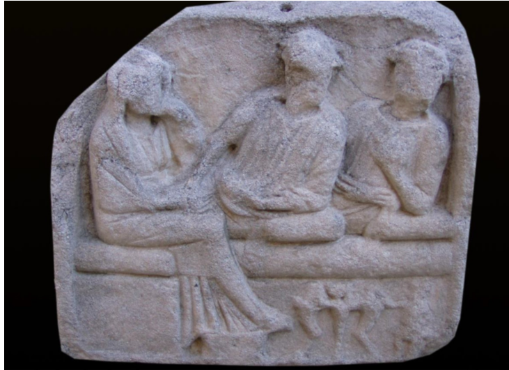
Fig. 6. Pudicitia Philista (Sonkaya 2008, 89 Pt. 3)

abrasion, her right arm is on the abdomen, and her left hand holds the edge of the chimation beneath the chin. A. Linfert suggests that the Pudicitia Philista type was exclusively used on grave steles and was prevalent in western Anatolia, gaining widespread usage from the mid-II nd century B.C. 40 . While the male figures are heroized, the female figures are depicted in mourning. This consistent depiction has been observed in all grave steles and reliefs featuring feast narratives in Greece, Rome, and Anatolia. Sonkaya states that all the woman figures depicted on Lydia's grave steles are portrayed using the Pudicitia type, which he attributes to the absence of standing women on these steles 41 .