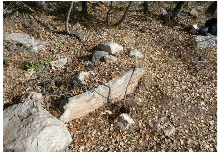
Fig. 11. Kayabaş West Sarcophagus

inner carving is 0.15 m, and the thickness between the eastern long side and the inner carving is 0.20 m.