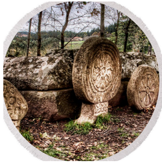
Fig. 16. Round Block Standing in the Necropolis

Within the immediate vicinity, there is a quarry, two ostothek mortises, four chamosorions, and three additional sarcophagi—one intact, one broken, and another completely crumbled. These remains collectively indicate that this area was a necropolis. Moreover, research conducted in the region has also uncovered reliefs depicting