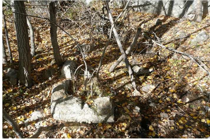
Fig. 10. Kayabaş South Sarcophagus

The studied reliefs and the rock mass on which they are situated mark the beginning of a rocky hill structure that extends towards the Kayabaş Neighbourhood in the north, parallel to the Korkuteli-Fethiye highway. Observations indicate that this extensive rocky mass is interpreted as both a necropolis and a stone quarry, considering the traces of stone cutting and its association with the necropolis area. These reliefs are directly connected to other remnants found in this area, as they are integral parts of the larger necropolis complex.