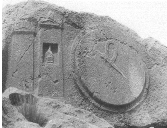
Fig. 15. Sini Taşı, Kınıclar (Milner 2004)