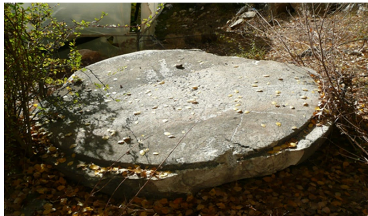
Fig. 12. Round Rock Block

The visible face of the block, which rests on the ground, does not display any figures, inscriptions, or decorations. It has been entirely smoothed and polished. The internal measurement from inside the bevels is 2.02 m. The thickness of the block varies throughout its structure. For instance, in the robust section on the right side, as viewed from the broken part on the northeast side of the stone mass, the measured thickness is 0.16 m, excluding the bevel thickness. Furthermore, the measurement from the broken part to the northwest of the round rock indicates a thickness of 0.40 m. This suggests that this symbolic rock originally stood upright on its thicker side. In fact, one of the elders from the Kayabaş Neighborhood mentioned that the round block had previously been standing upright, facing southwest. Additionally, he stated that the surface facing the ground today had a relief resembling a horse and a flag, and that the rock had been in this position until recently and was visible to the local population.