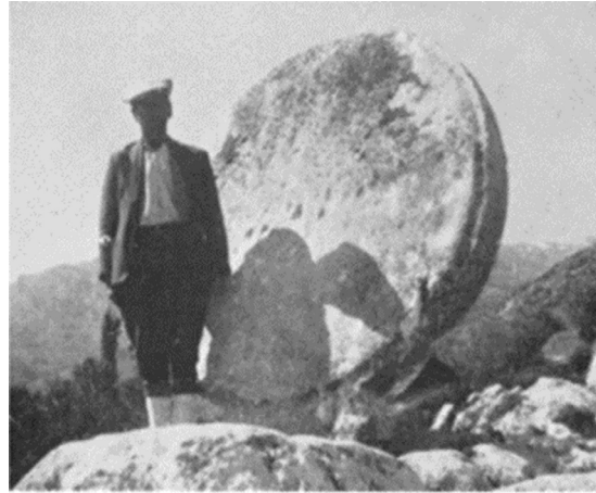
Fig. 14. Kalkantaş (Bean 1956, Pt 39e)

This rock block in the Kayabaş Necropolis, created through carving stands as the sole example in its immediate vicinity. While it is regarded as a standalone piece, comprehensive information has yet to be obtained due to the absence of detailed surveys and excavations in the region. Nevertheless, when considering the