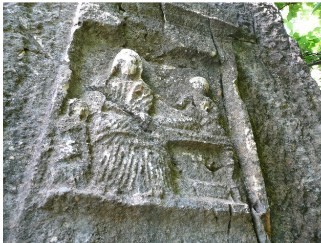
Fig. 4. Figures in the Symposium Scene