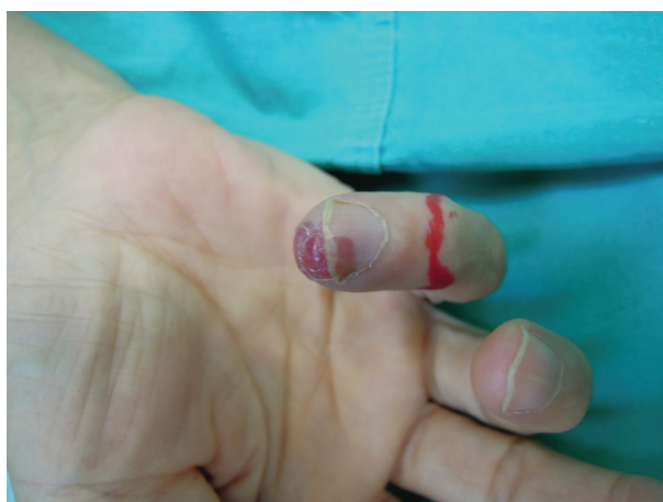
Figure 1: The lesion is seen as a red macule at the junction between the nail plate and the hyponychium of the right fifth digit.

The operative treatment of this acrometastasis did not aim for a survival benefit for the patient; however, palliation was planned due to the progressive pain and enlargement of the lesion. Amputation of the right fifth distal phalanx was performed and the specimen was sent to the Department of Pathology, confirming the initial diagnosis. The patient was referred to the Department of Medical Oncology and her symptoms were relieved right after the operation. She did not come for the clinical follow-ups one year after the amputation.