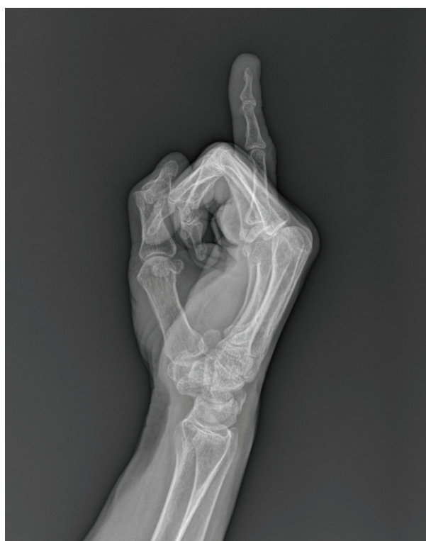
Figure 2: An osteolytic lesion at the dorsal aspect of the fifth distal phalanx is seen in the lateral view of the direct radiograph.