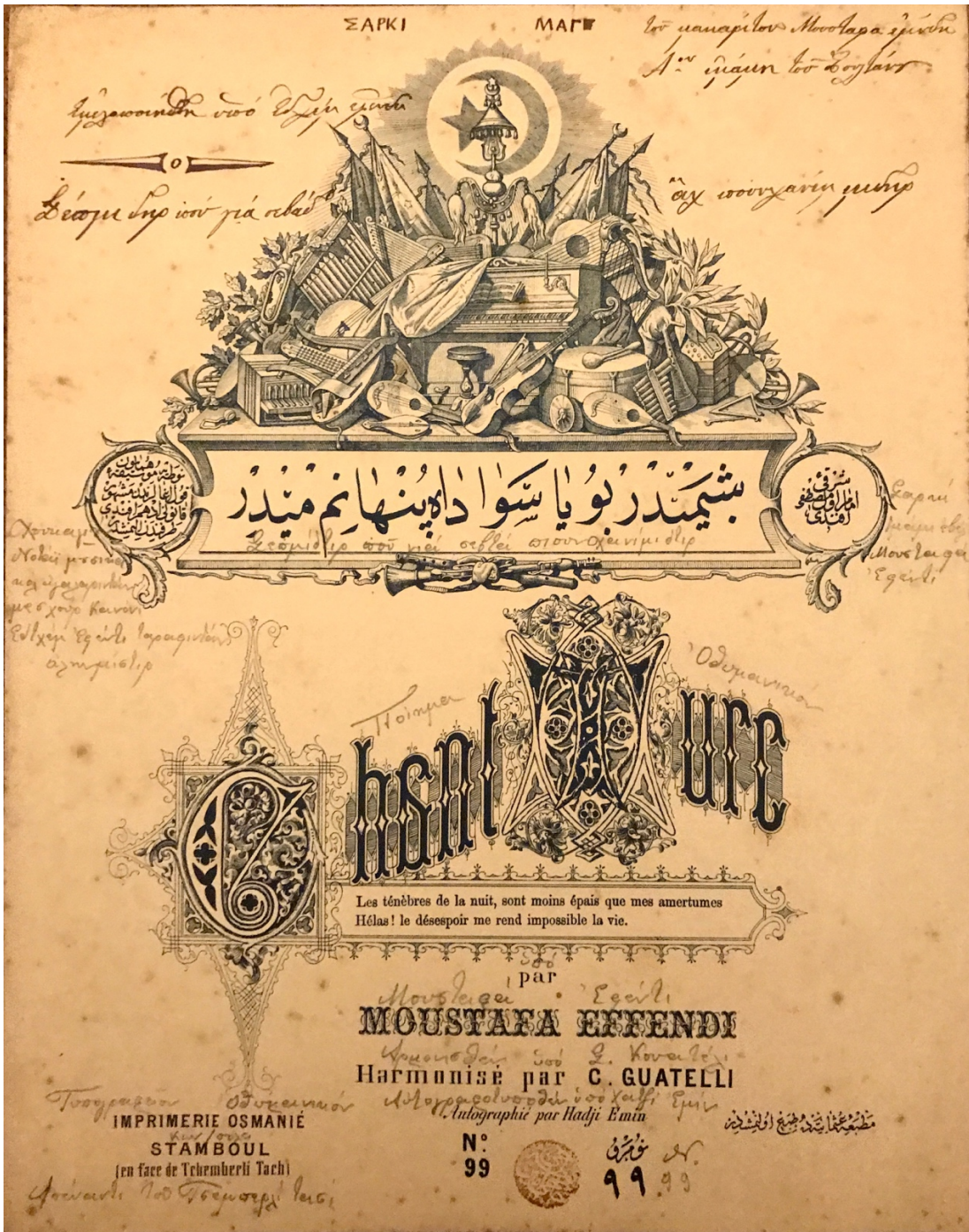
Image 2. A publication of Ottoman Turkish music from Kamarados's Archive © Kamarados's Archive, Greek Music Archive, Music Library of Greece "Lilian Boudouri".