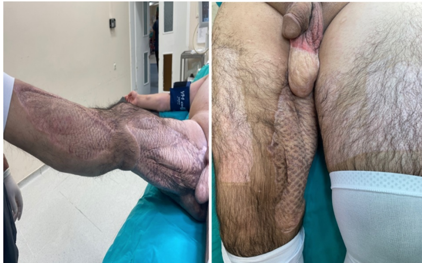
Figure 4. Appearance of well-being after treatment

After the control colonoscopy, the anal sphincter tone was also normal and the colostomy was closed. He was discharged on the 6th postoperative day.