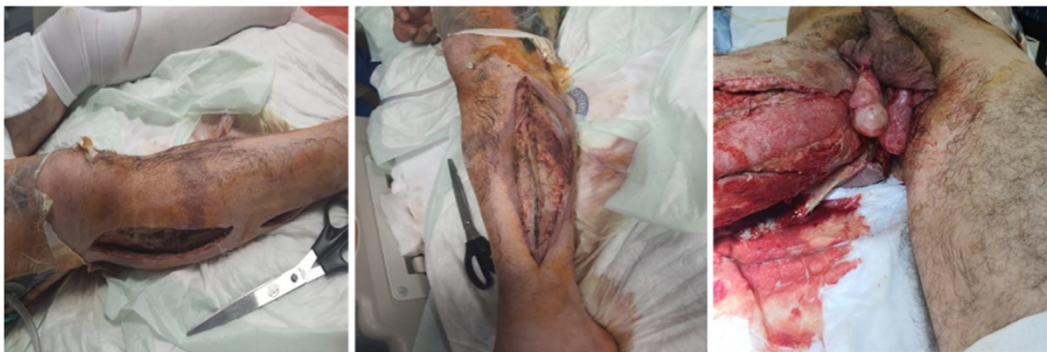
Figure 2. Clinical evaluation at admission

In addition, there was a large area of fasciitis reaching the fascia in the lateral of the right leg, anterior and posterior to the tibialis, and saphenous vein necrosis. Wound cultures were taken. Then, the necrotic tissues in the area were debrided, the saphenous vein was resected, and the operation area was washed with abundant isotonic solutions. Negative pressure vacuum therapy (NBVT) was started in the area. To prevent contamination, the patient underwent a laparoscopic sigmoid loop colostomy. The patient was taken to the intensive care unit after the operation and was consulted to the relevant departments. Infectious diseases were discussed. Imipenem and vancomycin treatment were started, following the antibiotic therapy recommendations. In the follow-up, due to weak peripheral pulses in the right lower extremity, cardiovascular surgery was consulted and ileomedin and heparin infusion was started for 3 days. Then, subcutaneous enoxaparin sodium and trentilin treatment was started. The patient underwent serial operations for debridement and NBVT. Upon the growth of Acinetobacter Baumani in the wound cultures of the patient, infectious diseases were consulted again and the treatment was continued with imipenem, vancomycin, and colistin. After