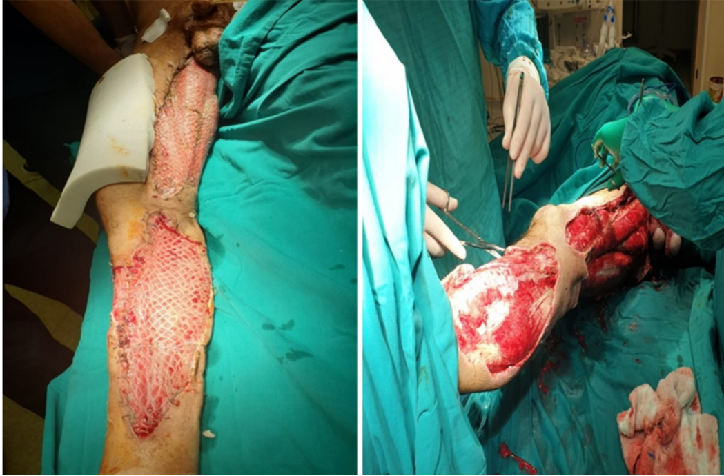
Figure 3. Post-treatment grafting stage images

Then, about 10 days later, the patient was transferred to the physical therapy unit for rehabilitation. After 10 sessions of physiotherapy exercises, he was called for control and discharged. The patient was admitted to our center about 1 year later with a plan for closure of loop colostomy (Figure 4).