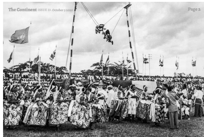
Happy Birthday, Nigeria!

The Continent has prepared special reports on various topics related to African countries, some of which are written in connection with their historical backgrounds. These papers include themes such as African flags, native languages spoken on the continent, and weaponry. Along with this, The Continent includes essential works on African history. One such example is the book "Born in Blackness" by American journalist and scholar Howard Waring French. The Continent conducts historical readings through photographs as well. For instance, criticism of the present-day can be seen in an image from the 1960s depicting Nigeria's independence celebrations.