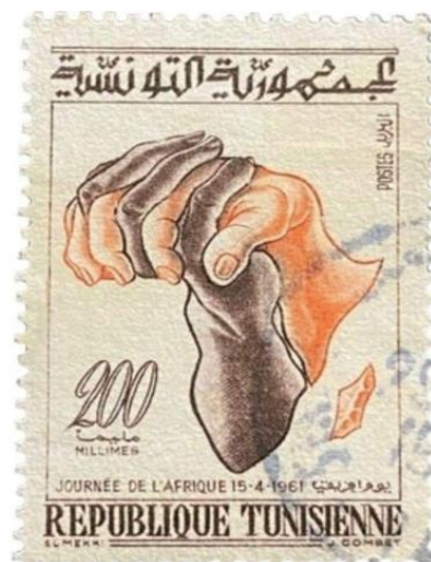
Lost in the mail: A 1961 stamp celebrating Africa Day

As well as addressing anti-immigrant sentiment in the United States and European countries, The Continent also draws attention to events in African countries. For example, the publication highlighted the measures taken by the Tunisian government against migrants from sub-Saharan Africa. Discussing the events in Tunisia, The Continent also published a postage stamp issued in Tunisia on Africa Day in 1961. The stamp depicts the shape of the African continent formed by the joining of white and black hands.