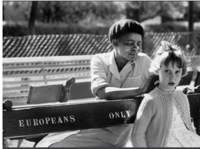
The Continent, Issue:129, s.15, June 17 2023

The Continent chronicles the first overseas tour of the Nigerian national team in 1949, also known as the Super Eagles, and provides information on the journey and its results. It is mentioned that the team traveled to England for 17 days by ship and conducted daily training sessions on the ship's deck during their journey. For the first time ever, Nigerian players were transferred to European clubs after the matches in England. After Nigeria gained independence in 1960, the team changed its name to "Green Eagles" and later adopted the name "Super Eagles," which is still used today (Olasoji, 2020: 19).