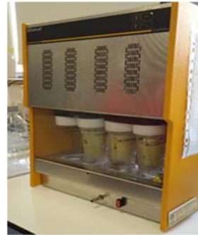
Figure 6. Soxhlet apparatus used for extracting oil.

Three different samples were prepared from powdered Luffa Aegyptiaca seeds. In the Soxhlet apparatus seen in Figure 6, 150 ml of hexane was used for each sample. The gained samples are used for oil content calculation.