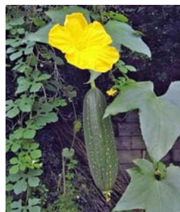
Figure 1. Luffa Aegyptiaca (20).

Within the scope of the study, the Luffa Aegyptiaca seed oil shown in Figure 1 was discussed. This plant was first grown in the geography of India. Over time, the loofah plant has spread widely throughout the world, including the Mediterranean coastline of Central and South America, Northeastern Australia, Asia, Africa, and Europe. In our country, in the Aegean and Southeastern Anatolia regions, especially in the Mediterranean region, people are grown in their gardens for personal needs [18]. Luffa Aegyptiaca has a very rapid development and growth process. The vines formed by the branching of this plant can exceed 10 meters in length. Also, Luffa Aegyptiaca is a taproot plant that forms many lateral roots. However, Luffa Aegyptiaca roots cannot go very deep into the soil [19]. Regarding our country, Hatay, which is situated in the Mediterranean area, stands out in terms of Luffa Aegyptiaca cultivation [18].