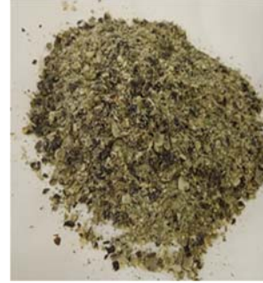
Figure 5. Luffa Aegyptiaca grounded seeds.

Three different samples were prepared from powdered Luffa Aegyptiaca seeds. In the Soxhlet apparatus seen in Figure 6, 150 ml of hexane was used for each sample. The gained samples are used for oil content calculation.