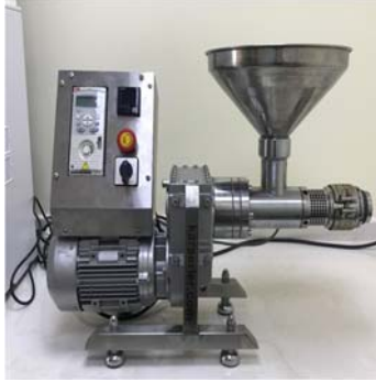
Figure 2. Karaerler NF 80 cold-press machine

The Luffa Aegyptiaca seeds were pressed in cold press (Figure 2) to gain oil