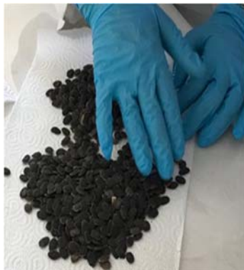
Figure 4. Luffa Aegyptiaca seeds

Figure 3 shows the Luffa Aegyptiaca oil sample. To determine the % oil in the seed, the Luffa Aegyptiaca seeds (Figure 4) were ground into powder as shown in Figure 5.