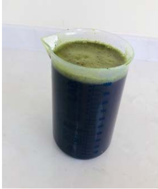
Figure 3. Luffa Aegyptiaca Oil sample.

Figure 3 shows the Luffa Aegyptiaca oil sample. To determine the % oil in the seed, the Luffa Aegyptiaca seeds (Figure 4) were ground into powder as shown in Figure 5.