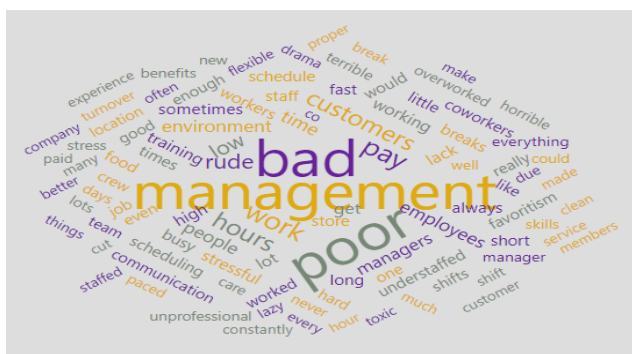
Fig. 6. Word Cloud of Bad Management Reviews

In Figure 6, the word cloud regarding the comments made by the employees about the mismanagement is presented.