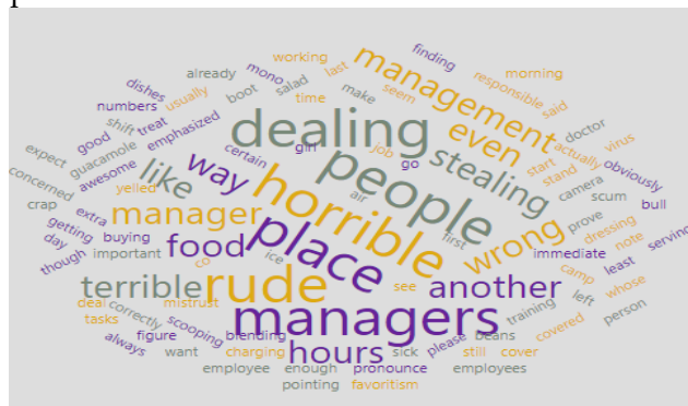
Fig. 7. Word Cloud of Theft-Related Comments

In Figure 7, the word cloud regarding the comments made by the employees about theft is presented.