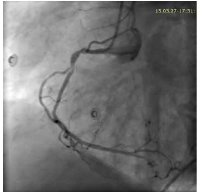
Figure 2: Right selective coronary angiography with left anterior oblique projection showing proximal severe right coronary artery stenosis.

Left coronary artery angiogram demonstrated an extraordinarily long serpentine vessel supplying LCX artery territory and the apex, which is normally supplied by the LAD (Fig. 3, 4). LAD was diagnosed as a totally occluded rudimentary vessel taking collaterals from the hyper-dominant LCX and the intermediate artery (Fig. 4).