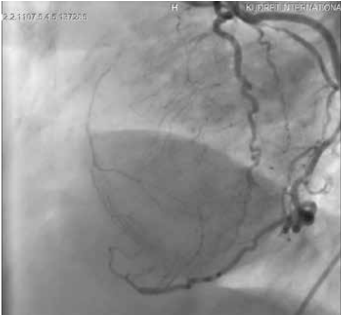
Figure 3: Left selective coronary angiography (10° right anterior oblique view with 19° caudal angulation): Hyper-dominant serpentine left circumflex artery.

mation of the origin as well as the course of coronary arteries. But in the present case, a CT angiogram was refused by the patient.