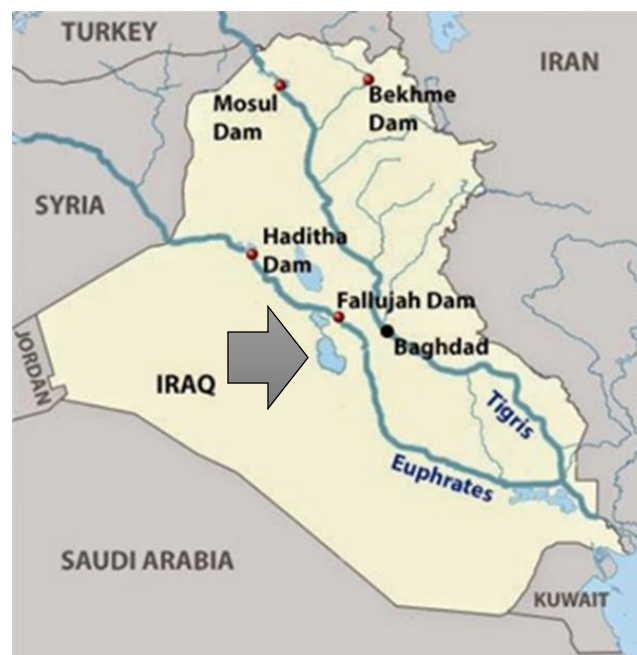
Figure 1. A map of Iraq has the sites of the study. The pointer site of study.

The study material consisted of a total of 320 fish, including 200 C. zillii from the Euphrates and 120 C. carpio from Razzaza Lake using the gill net collection technique. Fish specimens were gathered over the period spanning from December 2022 to the conclusion of April 2023. Fish were immediately transported alive to the laboratory and then subjected to examination, Figure 1 .