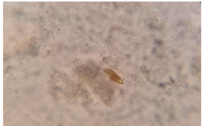
Figure 4. Dactylogyrus spp. in C. zillii gills X40.