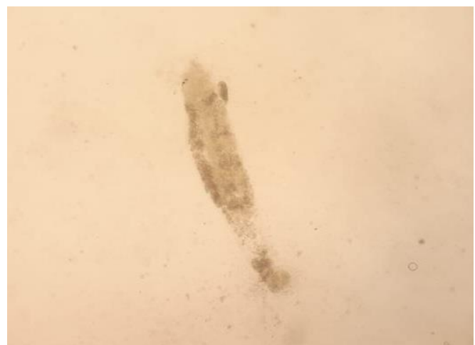
Figure 5. Gyrodactylus spp. in Cyprinus carpio fins X40.