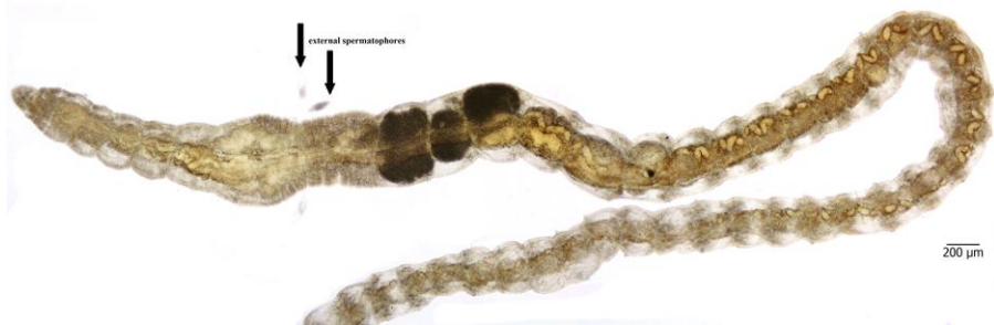
Figure 2. B. vej dovskyanum , whole body.

Habitat: The sampling site namely Karamenderes Stream is located on the western part of the South Marmara Region in north-western Anatolia (Turkey) (Fig. 1). Karamenderes Stream rises from the Kaz Dağı where has had a National Park established in 1993 on the Biga Peninsula, north-western Turkey (Demirsoy et al., 2005). The stream is rather shallow but flows along year and its benthic habitat dominated by cobol-gravel substrate in the upstream and sandy with submerged vegetation in the downstream. Specimens obtained from upstream in habitat with sand and stony substrates. The coexisting taxa the oligochaeta were Chaetogaster diaphanus , Ophidonais serpentina , Stylaria lacustris , Slavina appendiculata , Nais barbata , Nais bretscheri , Nais variabilis , Tubifex tubifex , Psammoryctides albicola , Limnodrilus udekemianus , Limnodrilus hoffmeisteri .