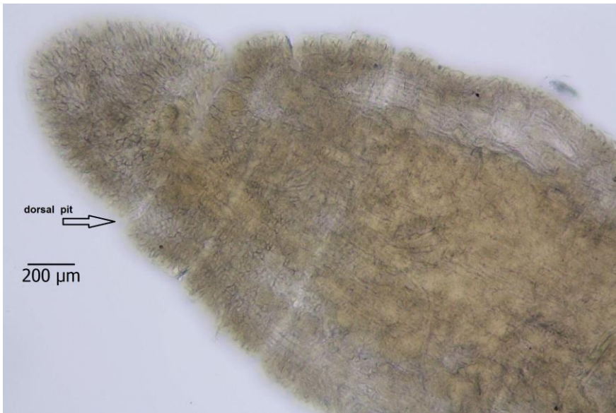
Figure 4. B. vej dovskyanum , prostomium with sensory pit.