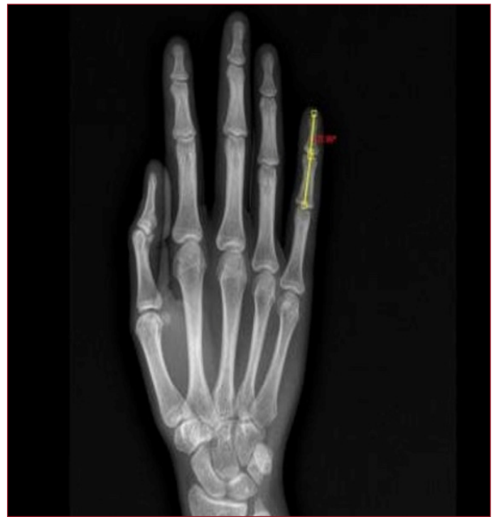
Figure 1b: The picture shows the measurement technique of the angulation of fifth finger by using the X-ray (b).