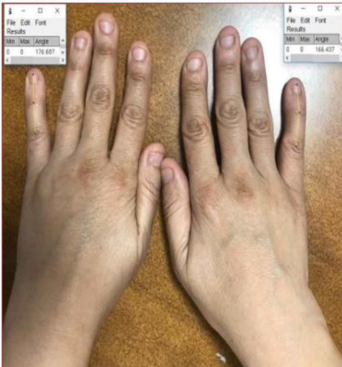
Figure 1a: The picture shows the measurement technique of the angulation of fifth finger by using the photo (a).