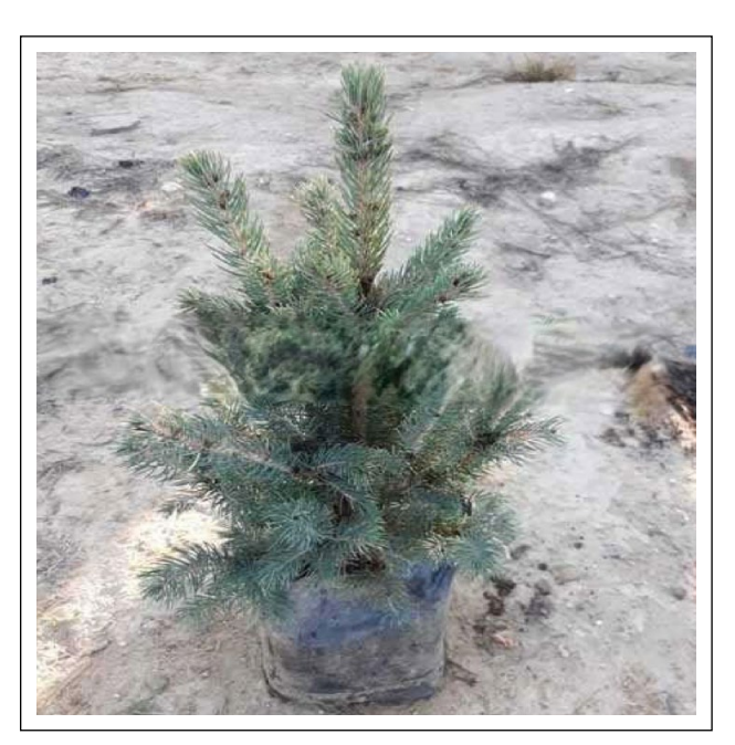
Figure 4. Picea pungens [47].

Black pine, which is widely distributed in Türkiye and also grown in Europe has characteristics as follows [46].