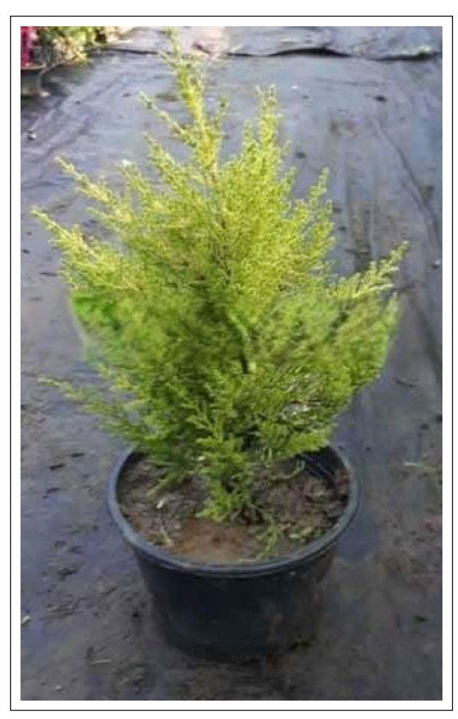
Figure 3. Cupressus macrocarpa [45].

following properties [46]: a) It is long-lasting because it can live for 1000 years. It can reach up to 20–25 meters, and the crown width can reach up to 5 meters. b) It is a species that thrives in warm Mediterranean climates. Like light, it can also grow in semi-sunny areas. It is used as a decorative tree, and the curtain is one of the tree species, c) Cupressus macrocarpa leaves, which can form pyramids, are also known as Lemoni Servi because they are yellowish and have the smell of lemon (Fig. 3).