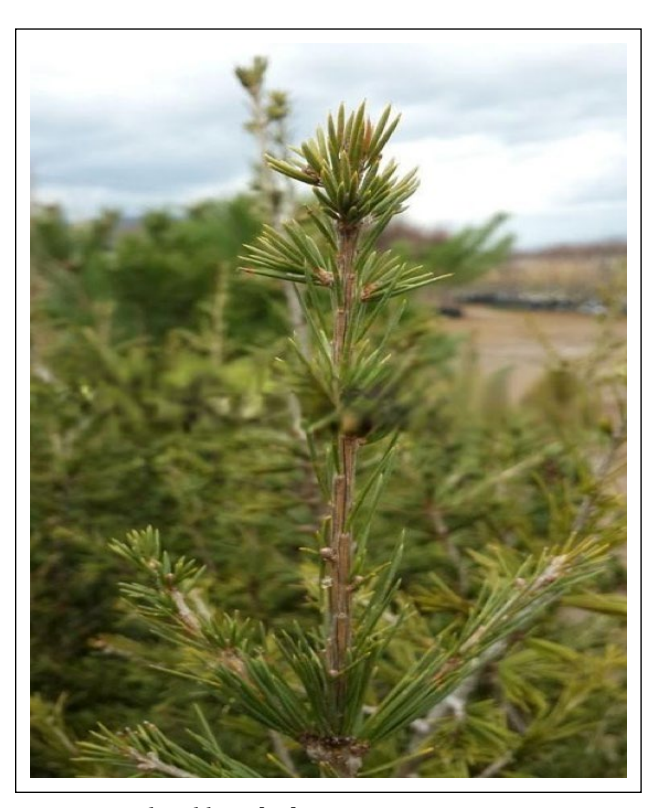
Figure 2. Cedrus libani [45].

The Value Engineering Team identified coniferous and purchasable alternative tree species suitable for the geography of the area to be parked, complying with all the determined criteria. The names and characteristics of these trees are described below.