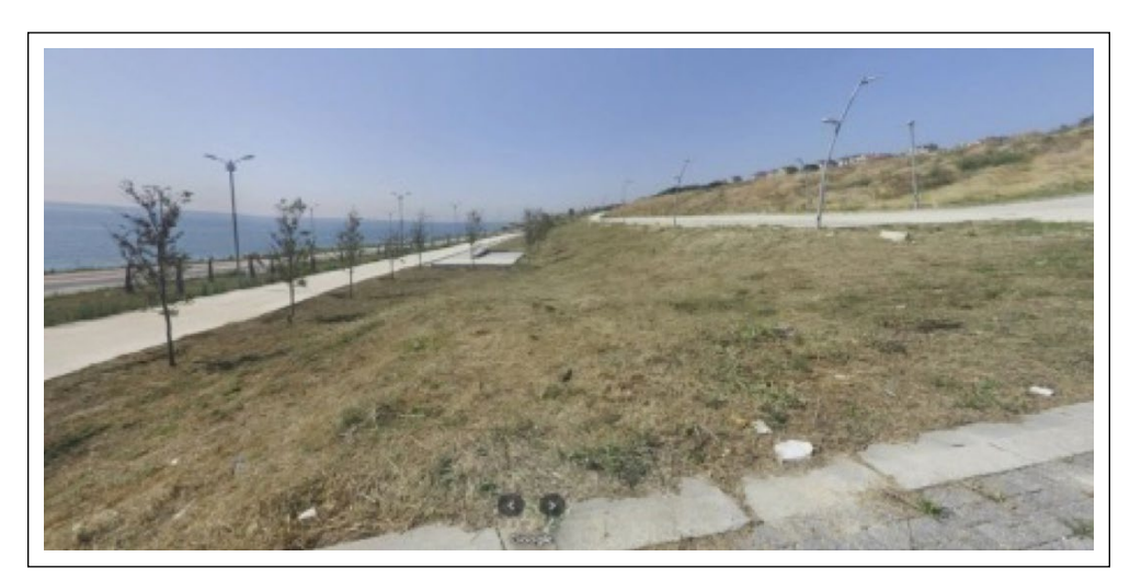
Figure 1. Location of Sinanoba beach park [42].

selection with the help of value engineering. In one study, partition material was selected for use in wall construction in a reinforced concrete structure with the help of value engineering [37]. In another study, the authors attempted to determine which material/method should be chosen to fill the gap between the shoring wall and the structure using the value engineering method [38]. While in another study, the value engineering method was used to select the exterior cladding material in a building from among sustainable materials according to LEED criteria [39]. Hosseinpour et al. [40] conducted a cost-benefit analysis of the application of urban agriculture in a sustainable park design in their study and benefited from value engineering in this study.