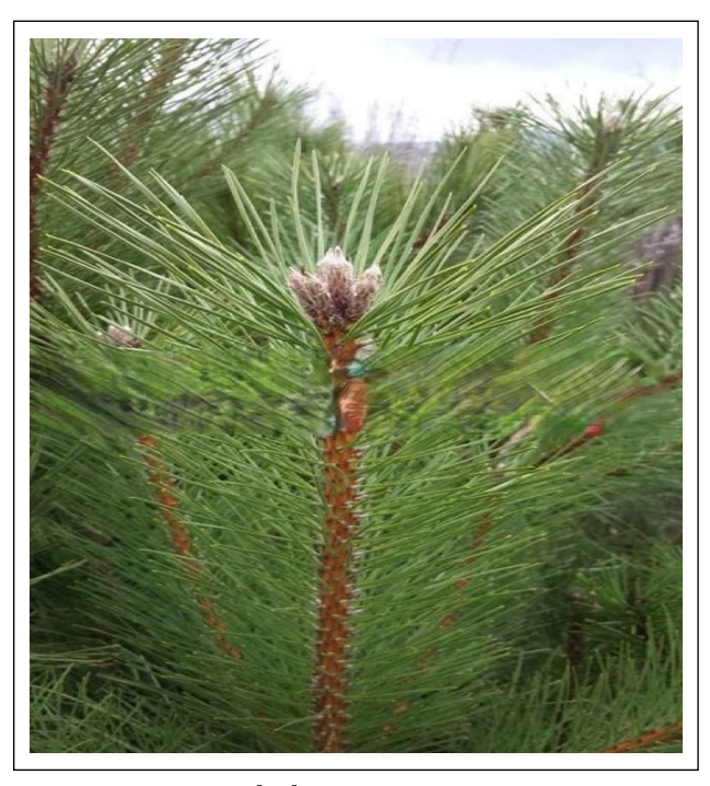
Figure 5. Pinus nigra [48].

a) Larch plants, which can live for an average of 1000 years, can reach heights of up to 20–30 meters, b) They can live in hot and dry places and adapt to all types of climates. These plants can withstand frost events and temperature, c) The leaves are always green. It is tolerant to air pollution, such as blue spruce, and is suitable for urban use (Fig. 5).