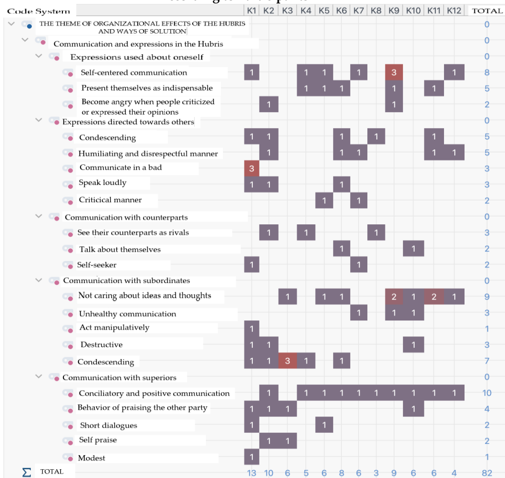
Figure 1.3. Density Matrix of Communication and Expressions Category Codes in Hubris According to Participants

The density matrix of the communication and expression category codes in the hubris according to the participants is given in Figure 1.3. Accordingly, participants with code k9 made intense expressions for self-centered communication, k1 for bad communication, k9 and k11 for disregarding ideas and thoughts, and k3 for condescending code.