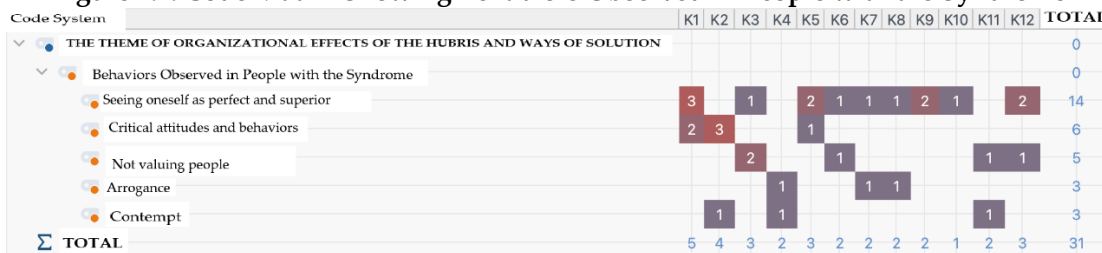
Figure 1.2. Code Matrix Showing Behaviors Observed in People with the Syndrome

The density matrix of the category of behaviors observed in people with the syndrome is shown in Figure 1.2. Accordingly, the participants with the codes k1, k5, k9, and k12 expressed intense interest in the code of seeing themselves as perfect and superior, k1, k2 in the code of critical attitudes and behaviors, and k3 in the code of not valuing people.