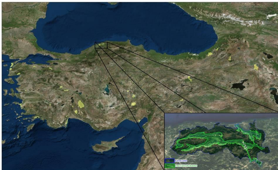
Figure 3. Location and boundry of Küre Mountains National Park

Küre Mountains National Park (KMNP) is stay on within the provinces of Kastamonu and Bartın in the Western Black Sea Region and was declared as a national park in July 2000 due to its unique values, old and natural forests and rich biodiversity. KDMP covers 80,000 ha area and has a 37,000 ha core zone with the primary aim to conserve the nature and a buffer zone, which currently has not an official status, a forest with ongoing production operations and rural settlements (Orman koruma alanları yönetimi projesi, 2009). The location of Küre Mountains National Park is given in figure 3.