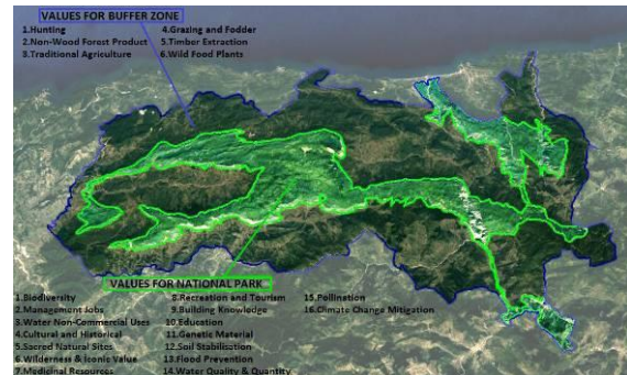
Figure 4. Distribution of the benefits in the national park and its buffer zone

The meeting concentrated on assessing the values for the local people living inside and adjacent to the protected area. Values related with the wider group of stakeholders were only discussed for the key values. The results from the community meeting in Bartın, researchers and forest experts in Bartın and researchers and forest experts in Kastamonu are given in Table 3.