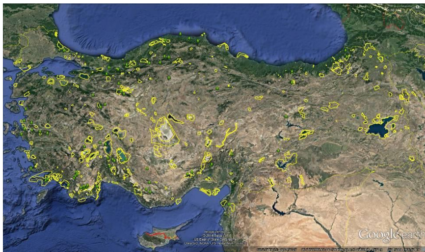
Figure 1. Distribution of protected areas in Turkey (Official reports, 2016)