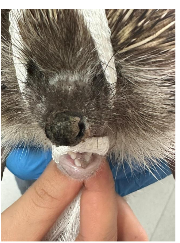
Figure 2. Use of cerclage wire in symphysis mandibulae.

A stab incision was made in the skin ventral to the symphysis mandible. An 18G hypodermic needle was inserted along the lateral surface of the mandible and removed into the oral cavity following the caudal aspect of the lower incisor. A 0.3 mm cerclage wire was passed through an 18G hypodermic needle. The needle was inserted from the opposite side of the mandible in the same way, and the cerclage wire was curved and removed from the point where it first entered after passing through the needle. After the fracture reduction was completed, the wire was stretched and cut outside the skin incision, and then the wire was bent (Figure 2), (Figure 3). A postoperative radiological image was taken (Figure 4).