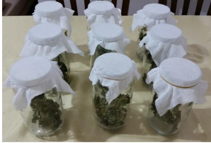
Figure 1. Cultured leaf samples infested with Tuta absoluta

monitoring of the samples continued until approximately one month after the emergence of adults began.