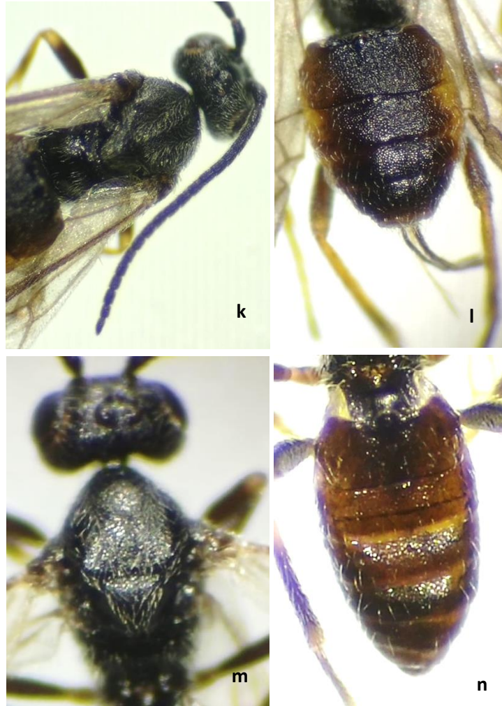
Figure 2. Bracon (Habrobracon) concolorans a-b: dorsal (female-male), c-d: ventral (female-male), e-f: antenna and wing (female-male), g-h: lateral (female-male), k-l: thorax-abdomen (female), m-n: thorax-abdomen (male)

The measurements for body length, head length, mesosoma length, metasoma length, ovipositor length and antenna length of both male and female B. (H.) concolorans are shown in Table 1. The average body length of B. (H.) concolorans males was 2.13 mm whereas the average body length of the females was 2.37 mm. The average antenna length in male and female individuals was 2.04 and 1.80 mm, respectively. In addition, the number of antenna segments was determined to be 20-23 in males and 18-21 in females.